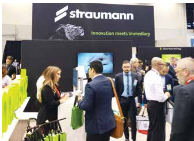
Attendees pack the Straumann booth, No. 301.