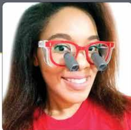
NEW Micro3.0EF Scopes™