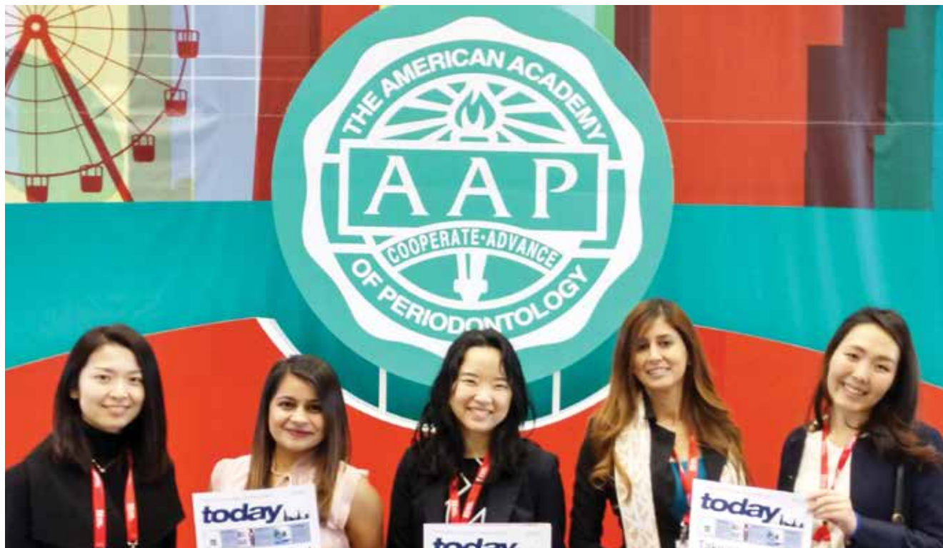
Attendees to the American Academy of Periodontology 105th annual meeting are all smiles Sunday afternoon.