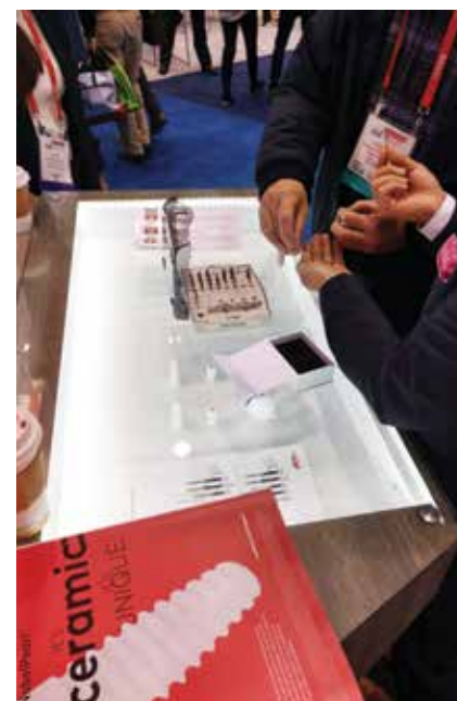
• Stop by the Nobel Biocare booth, No. 501, to get a demonstration of the NobelPearl ceramic implant system.