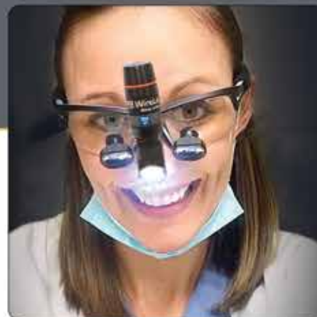
NEW LED DayLite® WireLess IR HDi