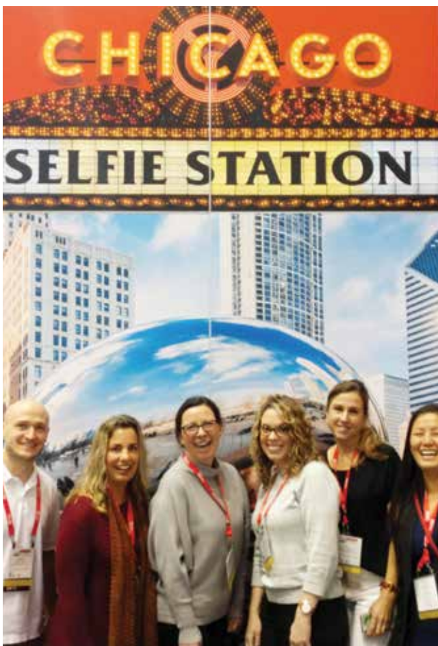
Don't forget to take a selfie, like these attendees, to remember your time here at the AAP annual meeting.