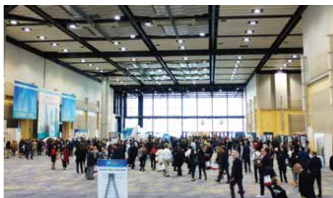
• A crowd makes its way to the exhibit hall on Sunday during the AAP annual meeting.