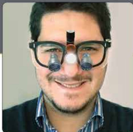
LED DayLite® WireLess Mini HDi and NEW 3.0x Loupes