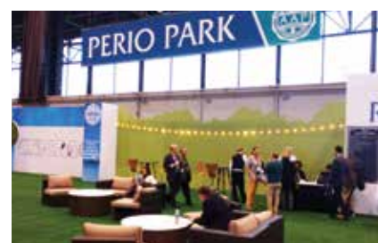
The Perio Park, found at booth No. 150, is a great place to relax, charge your electronic devices or purchase food and beverages.