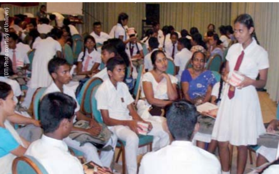
A Sri Lankan primary school student demonstrating a good toothbrushing technique to her teachers and peers during an oral health education session.

Partnership runs oral health promotion project in Sri Lanka