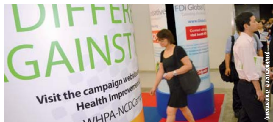
Information about the WHPA NCD campaign is available at the FDI Pavilion.

The WHPA represents over 26 million health professionals—dentists, nurses, pharmacists, physical therapist and physicians—through over 600 national associations.