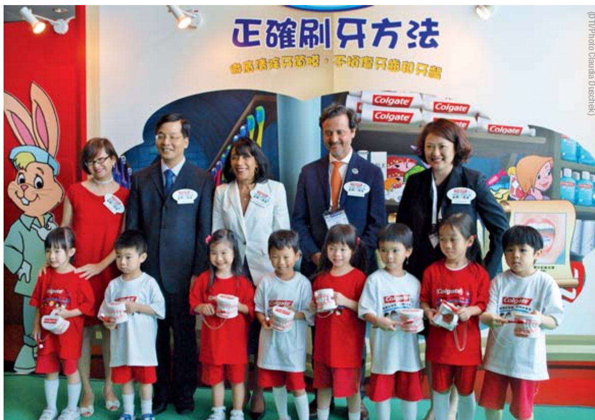
Group picture with children. More than 10,000 children will benefit from Colgate's Bright Smiles, Bright Futures programme in the next two years.

Bright Smiles, Bright Futures to benefit 10,000 preschool children in Hong Kong