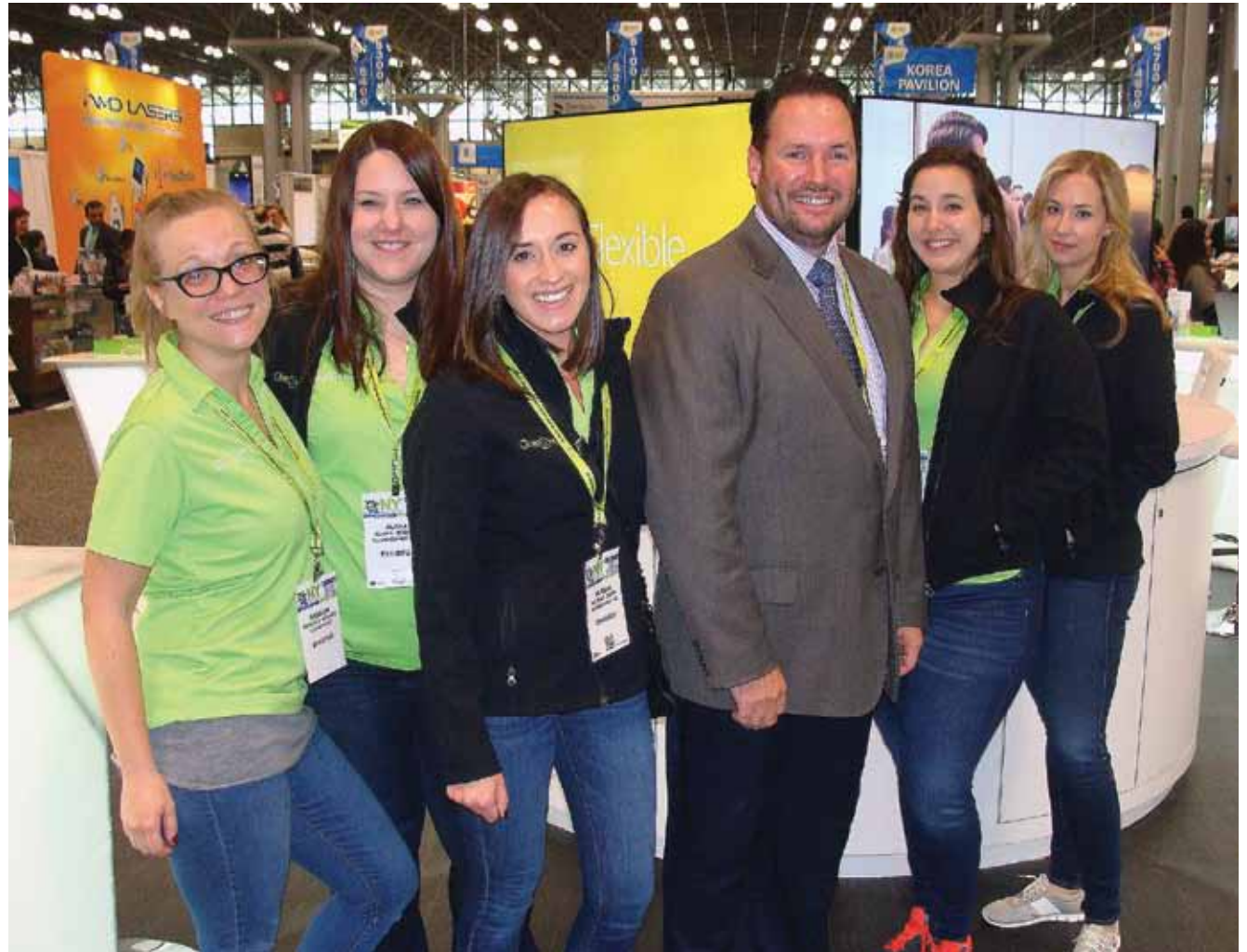
• The team from ClearCorrect (booth No. 5034).