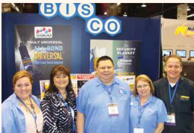
Bisco Dental Products (booth No. 1334) ... at your service!