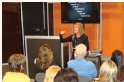
Attendees sit down at The Spot for an educational presentation Thursday morning.

But the learning does not stop there. On the exhibit hall floor, many companies are offering educational presentations right in their booths.