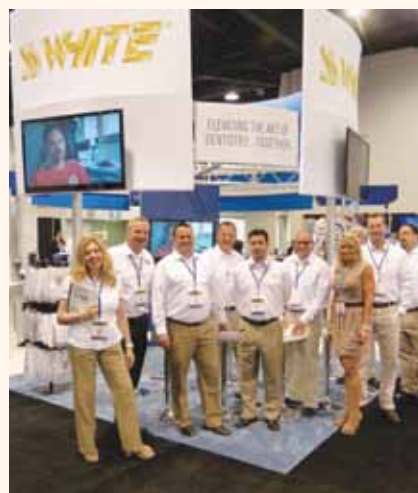
The SS White sales and marketing team shows off its new booth (No. 1180), which is making its general dentistry conference debut at CDA Presents.

A general dentist or endodontist can request that an SS White representative visit the practice to provide a thorough clinical presentation on the science behind