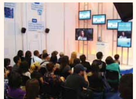
Meeting attendees learn about Crest and Oral-B products at booth No. 1350.