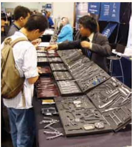
Meeting attendees shop for hand instruments at DoWell's booth (No. 224).