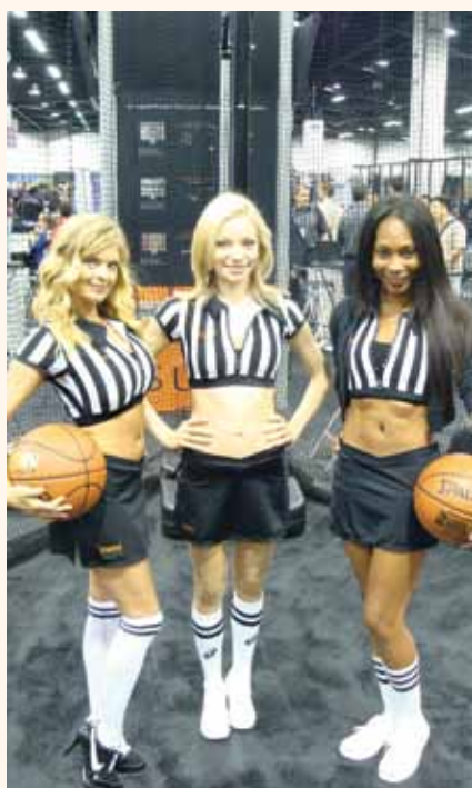
Take a basketball shot at the Suni booth (No. 2552) to win an iPad.