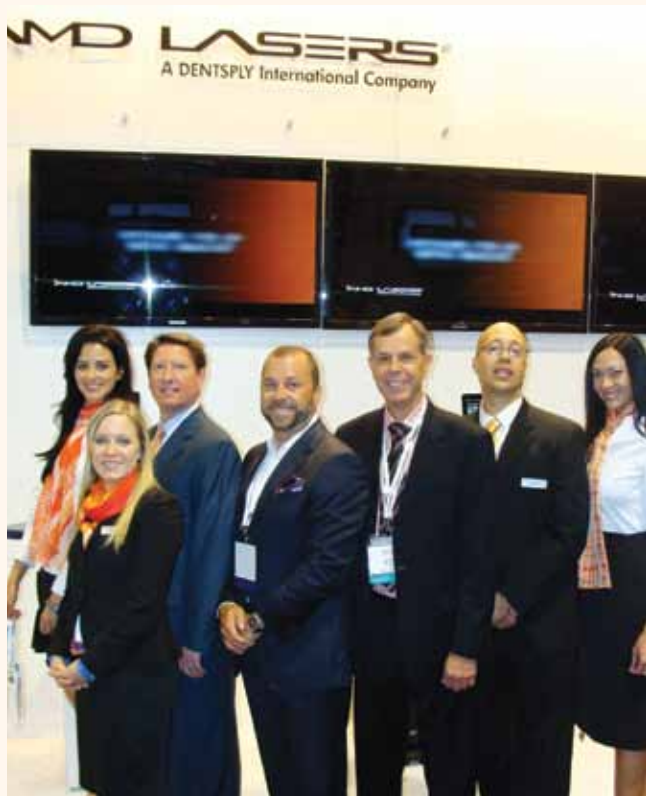
The gang at AMD LASERS (booth No. 1506).