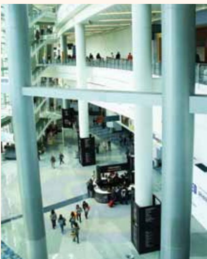
A view from above at the Anaheim Convention Center.