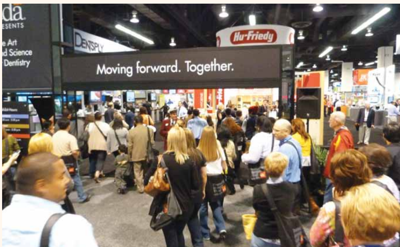
Attendees enter the exhibit hall at opening bell Thursday morning.

CDA exhibitors offer newest and most innovative products, services