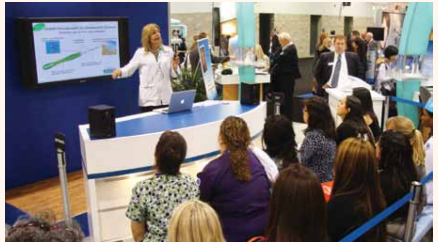
CDA attendees listen to a presentation at the Sunstar Americas booth (No. 1134).