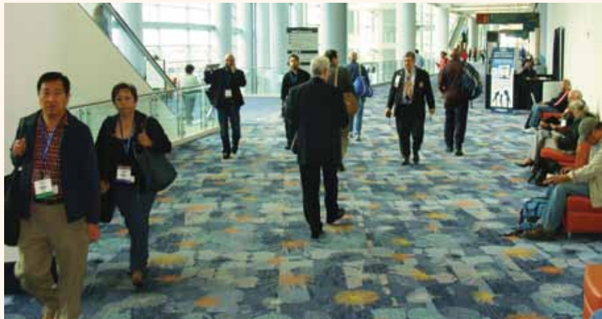
Meeting attendees walk to and from their educational lectures and workshops on Thursday morning.