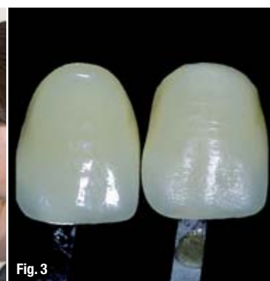
Fig. 1 _Using two OttLites held at tooth level 24 inches from the patient to control lighting colour temperature. Fig. 2 _Using the Trueshade light and magnifier to control light. Fig. 3 _Image of two of the same shade guides with different surface texture. Notice the one with a different texture is perceived as a different colour.

With ever increasing emphasis on aesthetics in dentistry, and patient demands to fabricate ceramic restorations that mimic natural teeth that are indistinguishable from adjacent natural teeth, the ability to evaluate tooth shade information correctly and communicate it to the ceramist effectively is now more critical than ever. Correctly evaluating tooth shade is as much an art as a science.