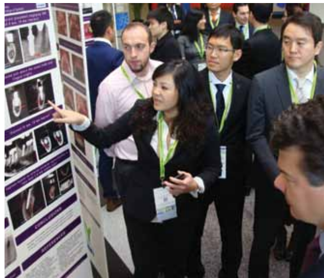
• Meeting attendees gather around a presenter to learn more about implant dentistry Sunday morning during the Scientific Poster Session offered by residents and post-graduate dentists.