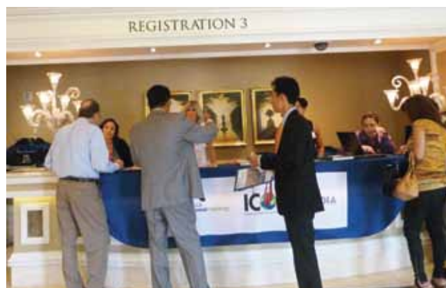
• ICOI Spring Symposium attendees hit the registration booth early Thursday.