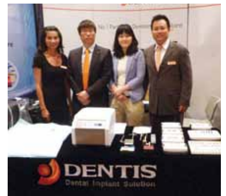
• The staff at the Dentis booth, No. 322, stands ready to help.