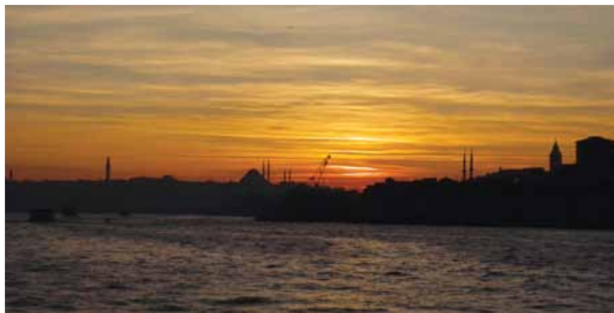
• A silhouette of Istanbul at sunset.

■ The International Congress of Oral Implantologists (ICOI) will convene its World Congress XXX in Istanbul, Turkey, from Oct. 3-5 at the Istanbul Lutfi Kirdar International Convention and Exhibition Centre in the heart of the European side of the dual-continent city.