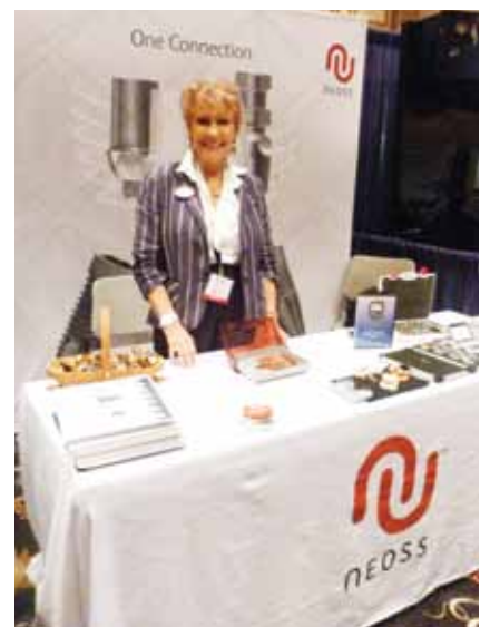
• You can earn an iPad just for doing some product shopping at the Neoss booth, No. 220. Ask Peggy Griffith about the show specials.