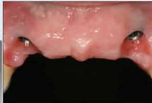
After four months of integration, the BioTemps and patient-specific abutments were removed, revealing very healthy pink tissue with trained tissue contours.