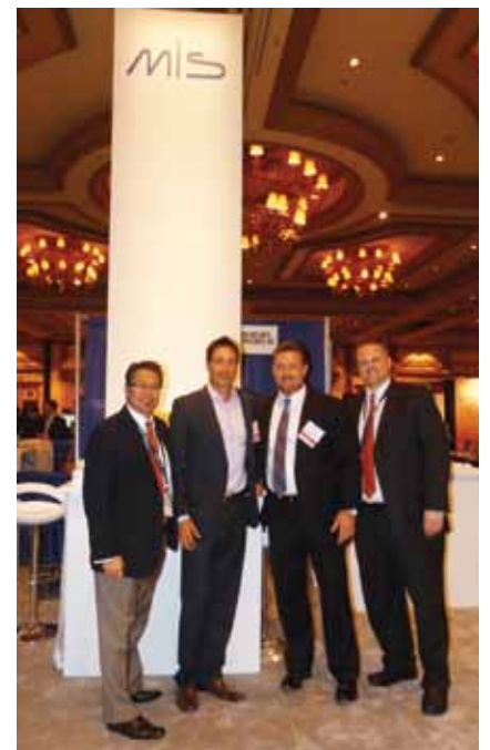
• Visit the MIS Implants Technologies booth, Nos. 409/411/508/510, to hear about the company's newest implants.