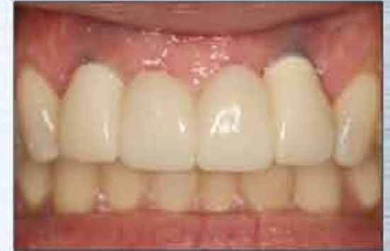
The BioTemps bridge #7-10 was seated, allowing for nice tissue healing prior to the final impressions.