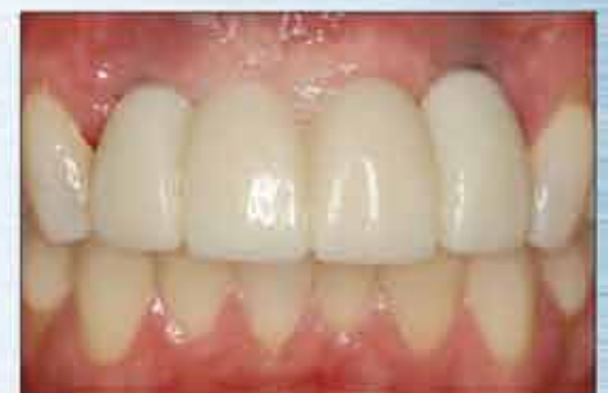
The final implant-retained bridge was cemented into place.