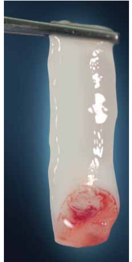
• L-PRF is a 3-D autogenous combination of platelet rich fibrin derived from the patient's blood.

L-PRF is an ideal carrier for bone material. When incorporated into the fibrin clot, the particulate biomaterial is suspended in the fibrin matrix. This enhances the handling characteris-