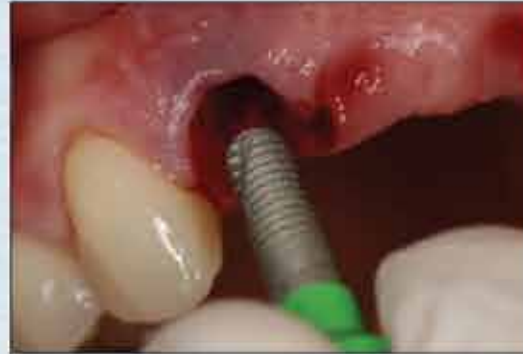
A 3.7 mm X 11.5 mm Inclusive® Tapered Implant was placed in the surgical site for tooth #7, as well as tooth #10.