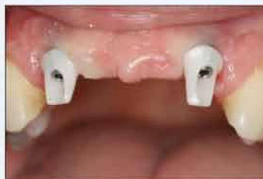
The final zirconia abutments were fabricated by the dental laboratory and torqued into place.