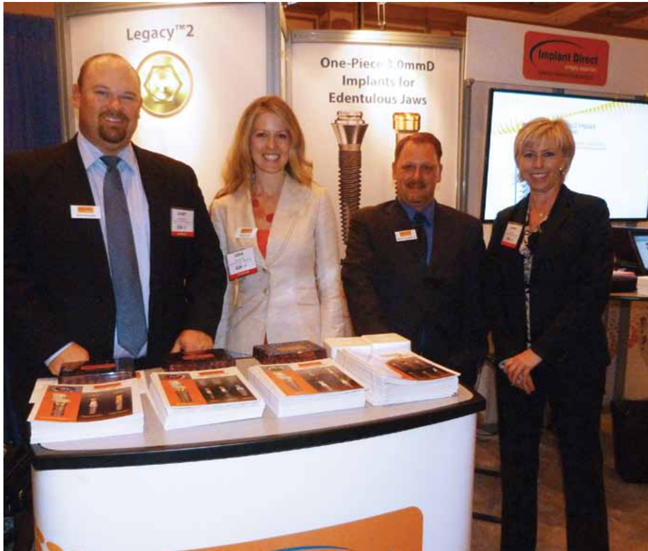
• Visit the Implant Direct Sybron International staff at booth Nos. 613/615.