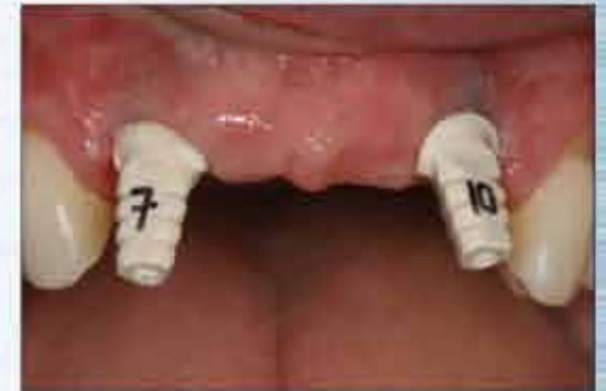
The custom impression copings match the patient-specific soft tissue contours of the custom temporary components.