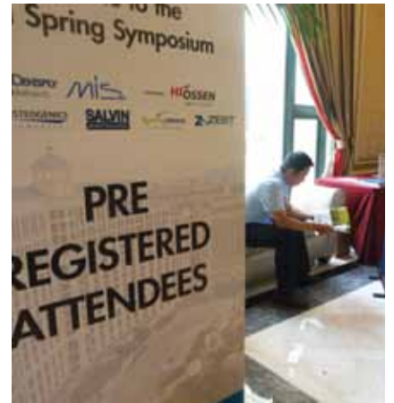
• Check the ICOI meeting program carefully to make sure you hit all the sessions you're interested in.