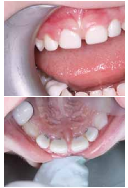
• After GlasIonomer CX-Plus

launch of its new direct restorative, GlasIonomer FX-II Capsule. Those interested in seeing the material are encouraged to visit booth No. 1229 for a first-hand product demonstration.