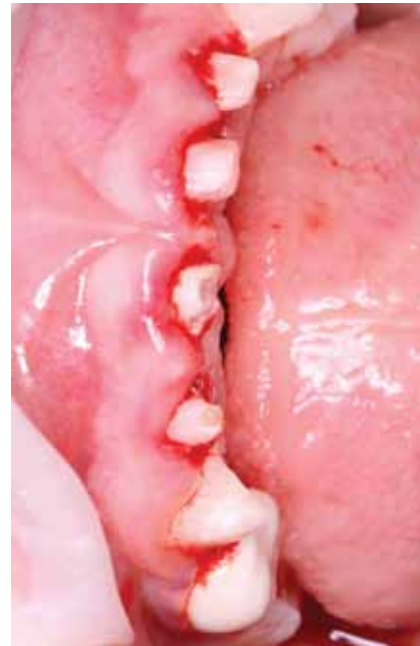
• Before GlasIonomer CX-Plus

The GlasIonomer FX-II Capsule: a glass ionomer direct restorative Shofu Dental is also announcing the