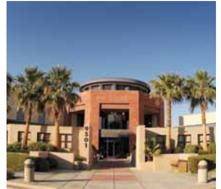
• The Las Vegas Institute for Advanced Dental Studies in Las Vegas.