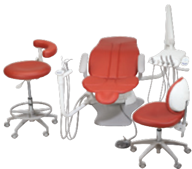
A-dec 300 Radius