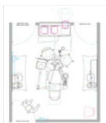
FREE design service †

Chairs Delivery Systems Lights Monitor Mounts Cabinets Maintenance Infection Control