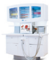
New cabinetry range