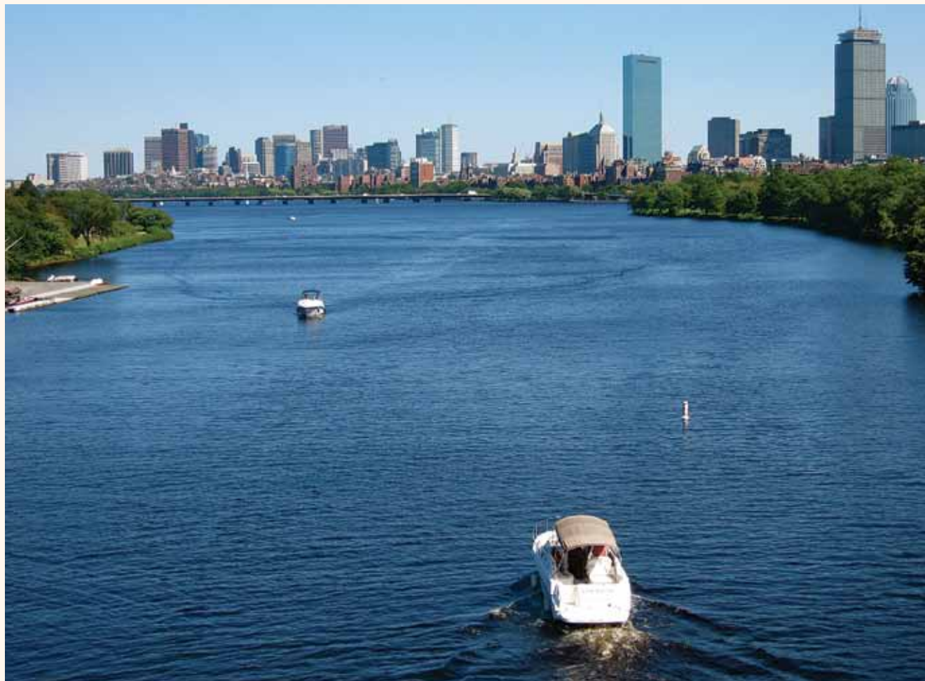
The downtown and Back Bay skyline.

Yankee Dental 2013 invites you to start your year off with a wealth of C.E. courses and social activities