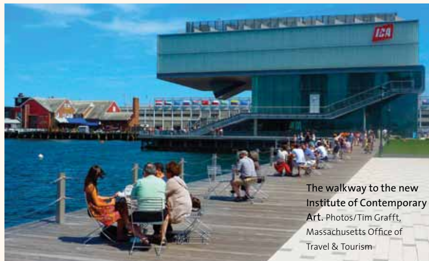
The walkway to the new Institute of Contemporary Art.