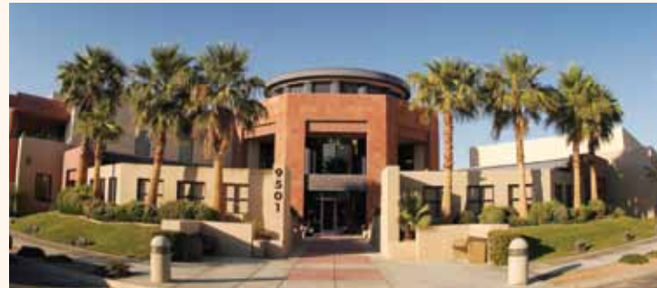
The Las Vegas Institute for Advanced Dental Studies in Las Vegas.

As a way to introduce you to the Las Vegas Institute for Advanced Dental Studies, or LVI, I want to outline what LVI is