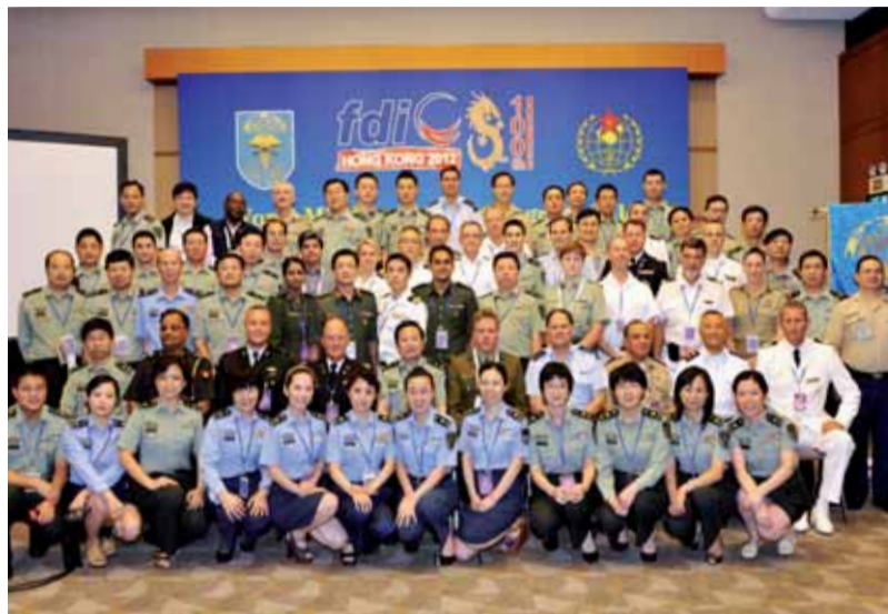
The SDFDS is welcoming new delegates from countries like Afghanistan this year.

In addition, management of dental service delivery, including performance assessment and improvement, readiness, dental management programmes, oral and maxillofacial treatment, as well as CAD will be in focus.