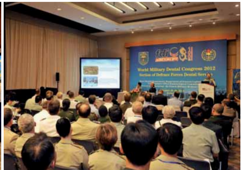
Delegates to the World Military Dental Congress listening to a presentation in the year 2012.