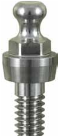
Sterngold Dental's new ORA, ball and o-ring attachment system.