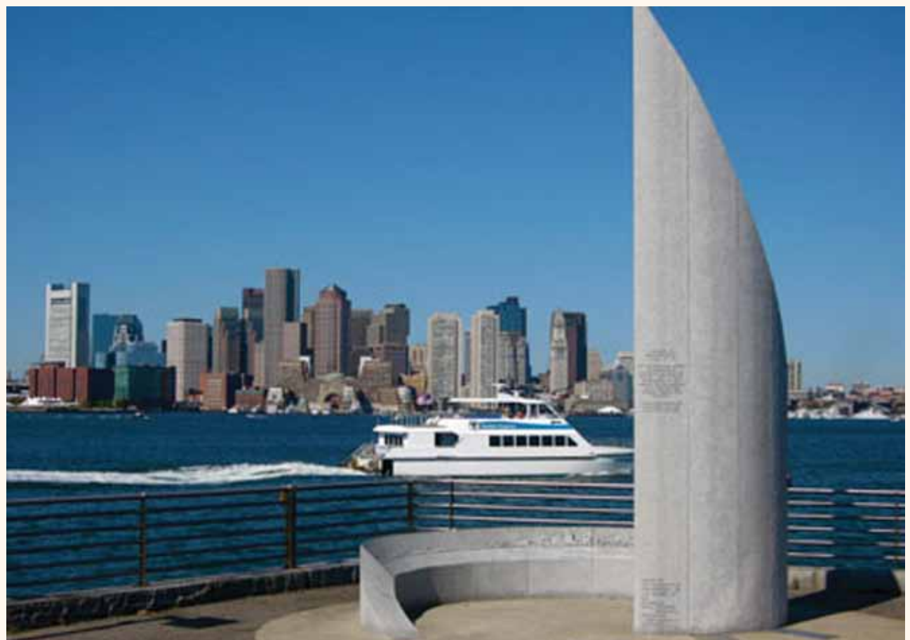
A view of Boston Harbor.