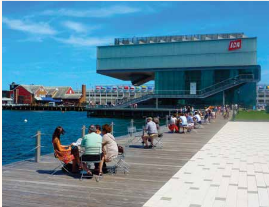
The walkway to the new Institute of Contemporary Art.

Kennedy's life, leadership and legacy in 21 exhibits, three theaters, 20 video presentations and more.