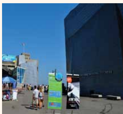
New England Aquarium and Imax Theater.