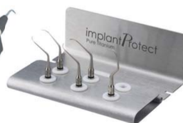
Implant Protect Pure Titanium tips