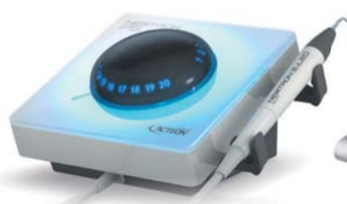
Newtron® Ultrasonic generator