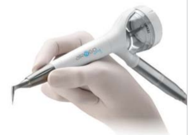
AIR-N-GO® easy Air polisher

Your allies to prevent and fight peri-implantitis