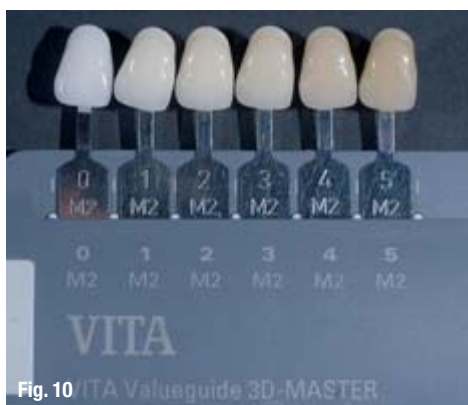
Fig. 10 VITA Valueguide 3D-MASTER