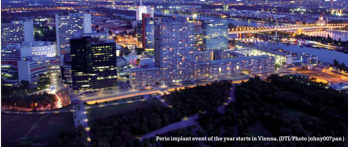
Perio implant event of the year starts in Vienna.

■ Dental professionals from all over Europe and abroad are expected to gather this morning at the Reed Exhibitions Congress Center in Vienna for the Europerio 7 congress. The scientific event, organised by the Austrian Society of Periodontology on behalf of the European Federation of Periodontology, will present the latest research and technology in the field of periodontology and dental implantology over the course of the next three days.