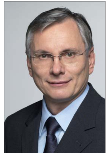
• Alois Stöger

oral health is a substantial part of general health and maintaining one's own teeth contributes significantly to one's quality of life and well-being. One of the main causes of tooth loss in adults is periodontitis. Since non-treated pe-