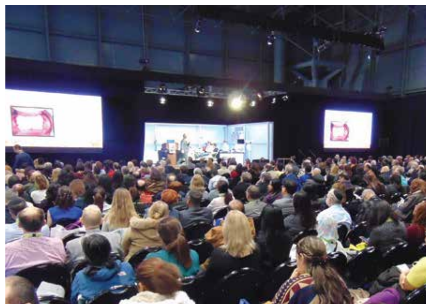
Meeting attendees gather for a live patient demonstration on the exhibit hall floor at the 2017 meeting.

Check your show guide or the meeting app for more offerings.