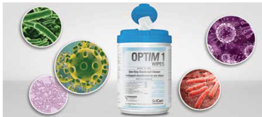
• COLTENE SciCan's OPTIM 1 Wipes.

specific contact times – the length of time disinfectant solution must be in contact with the target surface (i.e., keep the surface wet) in order to achieve the desired disinfection efficacy.