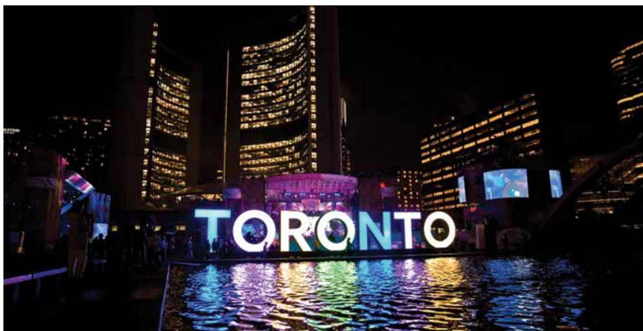
• A look at the city of Toronto from Nathan Philips Square. The Ontario Dental Association's Annual Spring Meeting is back in town after taking place virtually in 2021 because of COVID.