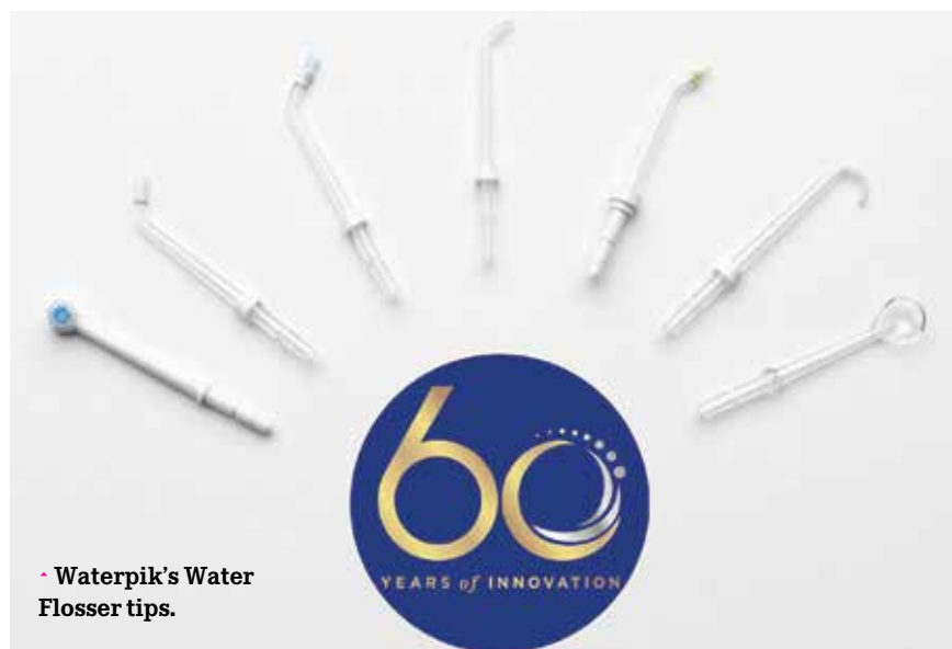
• Waterpik's Water Flosser tips.