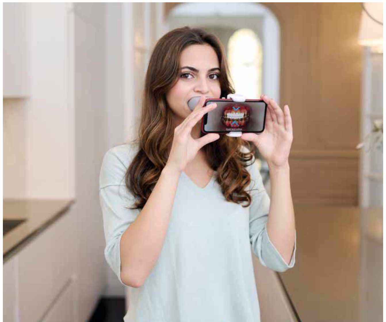
• The ScanBox pro, DentalMonitoring's latest FDA-registered innovation, is a portable device patients can take with them for precise AI-powered scans anywhere and anytime.

When backed by artificial intelligence, these remote monitoring plat-