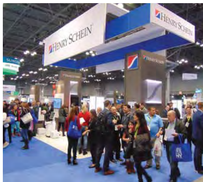
• The Henry Schein Dental booth (No. 4225).