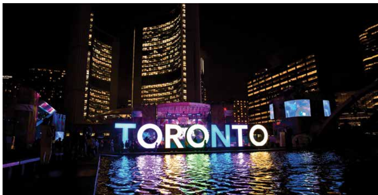
• A look at the city of Toronto from Nathan Philips Square. The Ontario Dental Association's Annual Spring Meeting is back in town after taking place virtually in 2021 because of COVID.