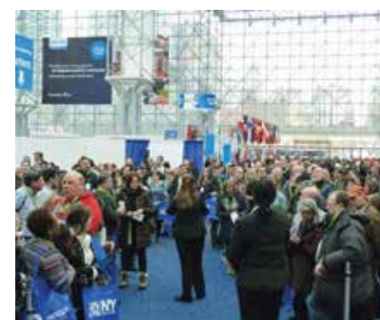
• Attendees at the 95 th annual Greater New York Dental Meeting await the countdown to the opening of the exhibit hall Sunday morning, the first day of the 2019 meeting's four days of exhibits.

Just two more days until the exhibit hall closes for another year, so be sure to grab these deals and more while they're available.