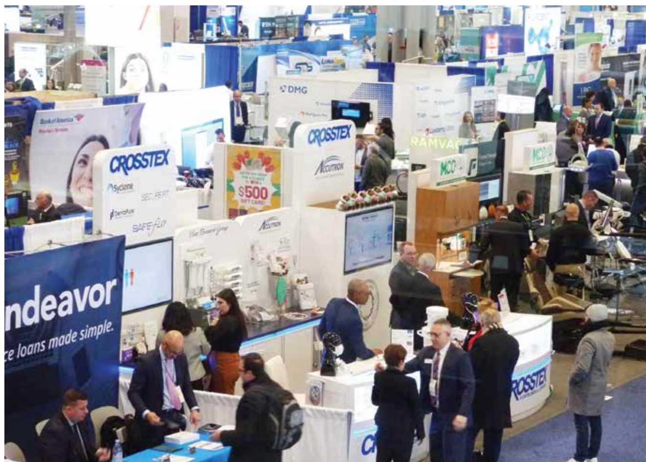
• Busy aisles Sunday morning in the exhibit hall.

Opinions expressed by authors are their own and may not reflect those of Tribune America or Dental Tribune International.