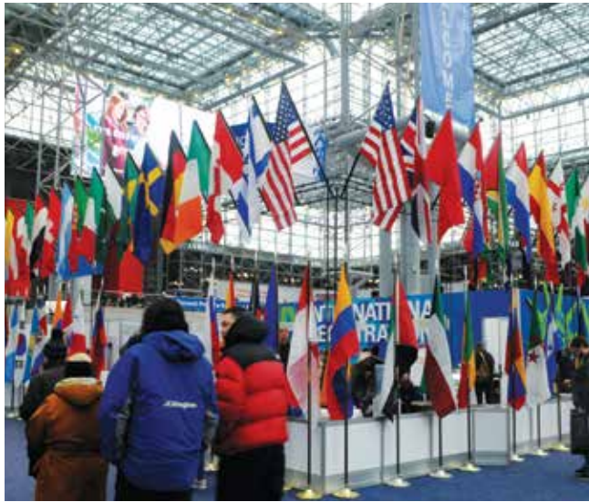
• The entrance to International Registration at the Greater New York Dental Meeting.