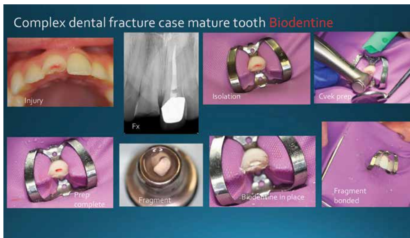
• Case: An emergency department patient tripped and fell, injuring his front tooth. Diagnosis: Complex crown fracture with no concomitant periodontal injury.

The unique setting reaction of Biodentine allows for more com-