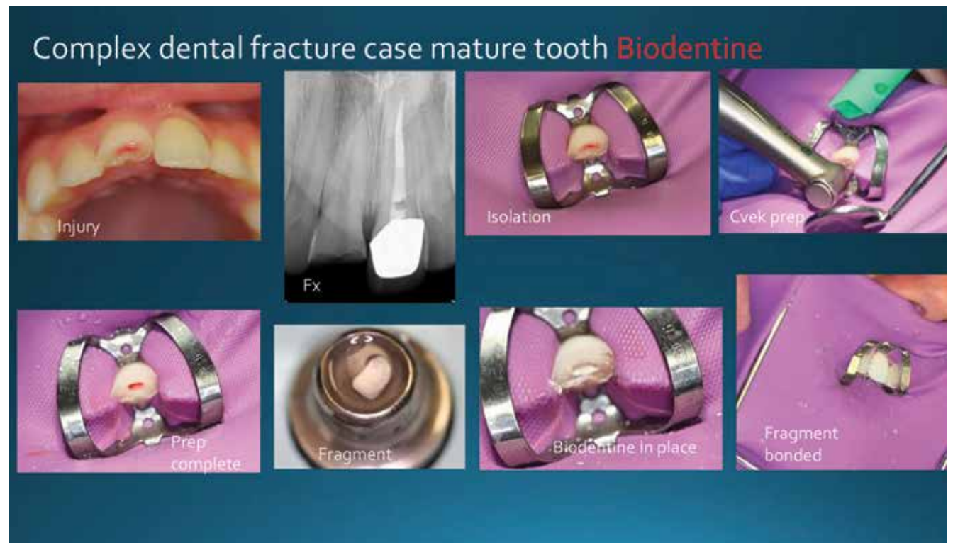
• Case: An emergency department patient tripped and fell, injuring his front tooth. Diagnosis: Complex crown fracture with no concomitant periodontal injury.

The unique setting reaction of Biodentine allows for more com-