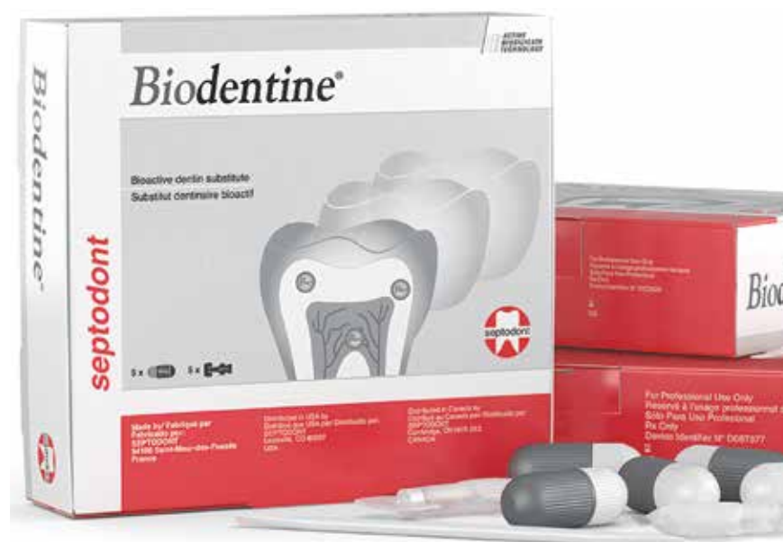
• Biodentine is available in five and 15 packs.

plete sealing of the material at the margins.