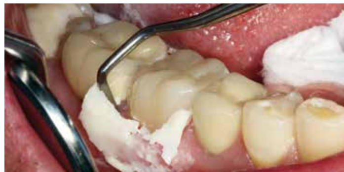
• Simple and easy clean-up of TheraCem.

TheraCem is easy to clean up with hand instruments and floss. For deeper subgingival margins,