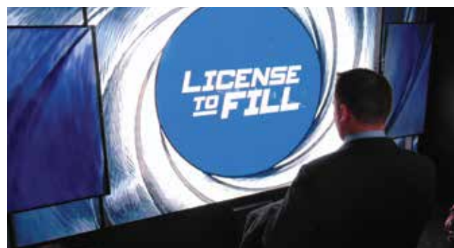
• You can see a James Bond-themed movie presentation in the Henry Schein One booth (No. 2825).