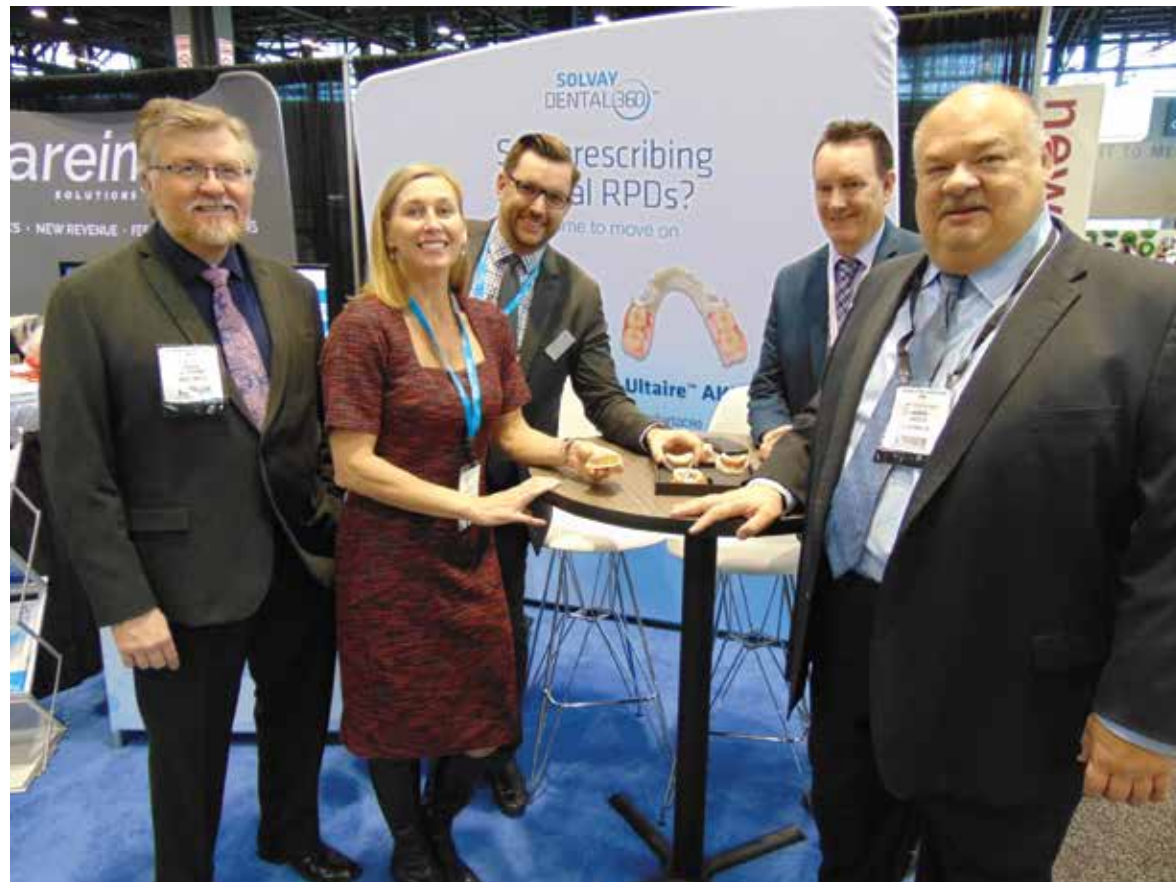
• The folks at Solvay Dental 360 (booth No. 1545) are here at the Midwinter Meeting to tell dental professionals about Ultraire AKP, a high-performance polymer for RPD frames.