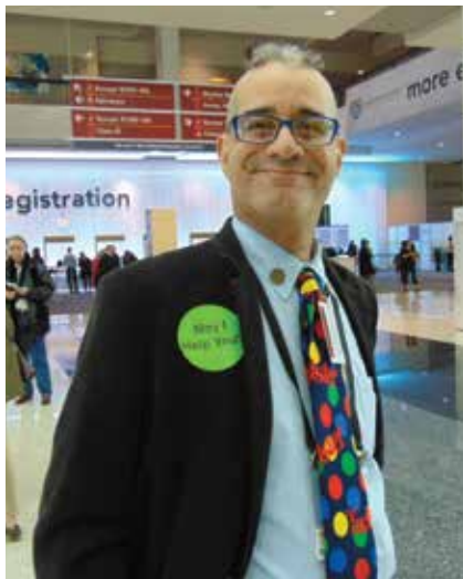
• Here at the Midwinter Meeting, Mercury is available to help attendees with information.