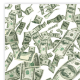
Exclusive Show Promotions

Supplies | Equipment | Practice Management Systems | Digital Technology | Technical Service | Business Solutions