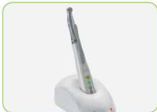
IA-400 Digital torque wrench