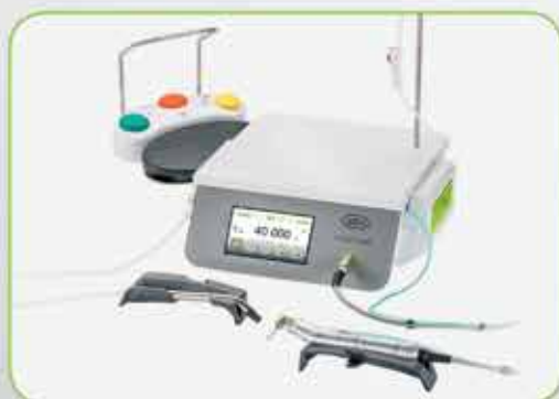
Implantmed SI-1015 with wireless foot pedal option, Osstell ISQ option and LED powered motor option