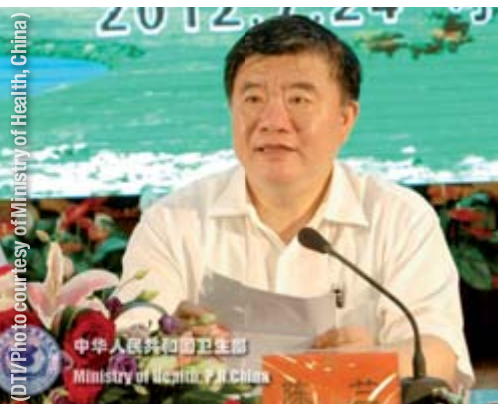
Prof. Chen Zhu