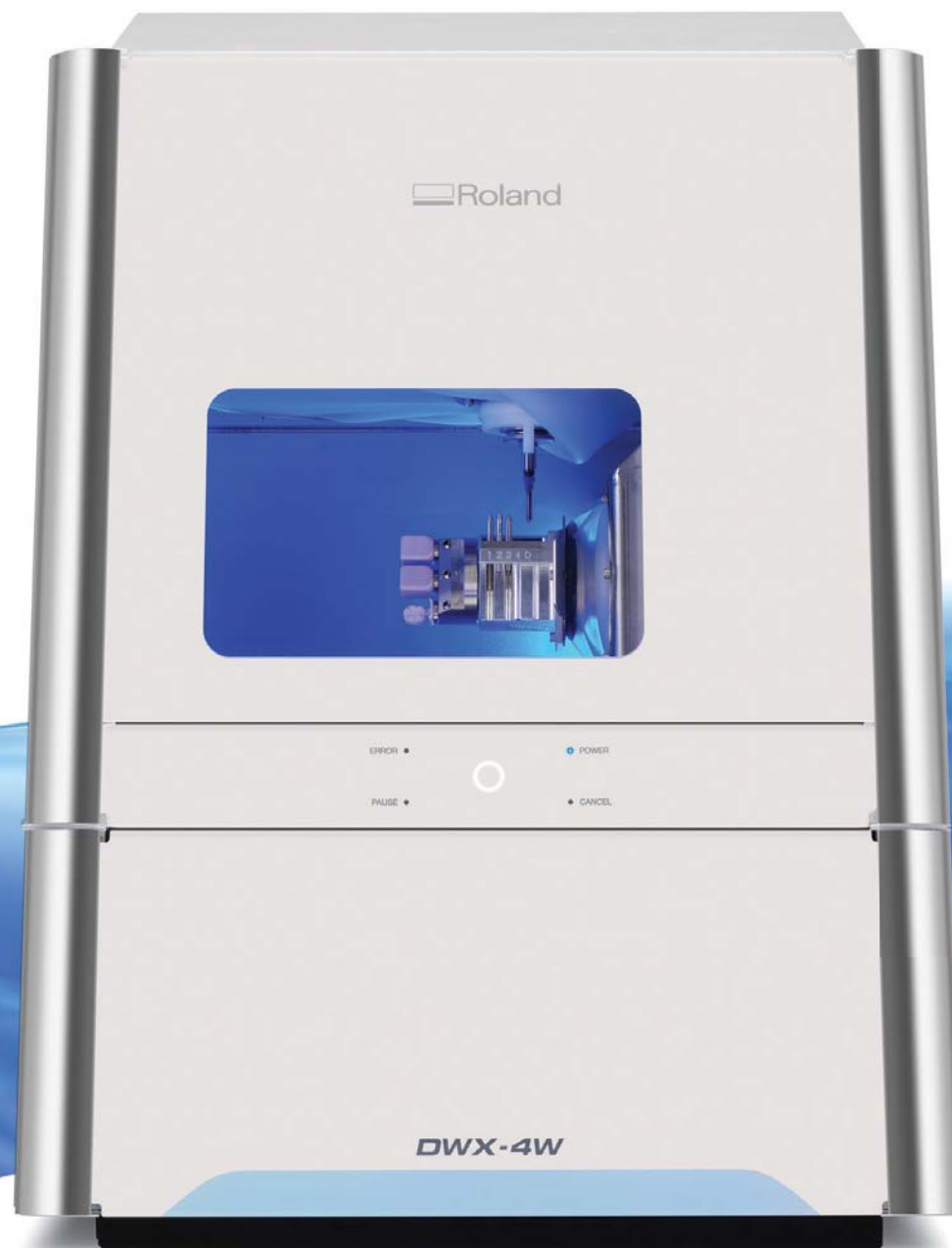
THE NEW DWX-4W Wet Dental Mill