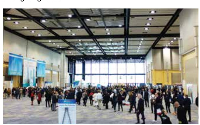
^{\circ} A crowd makes its way to the exhibit hall on Sunday during the AAP annual meeting.