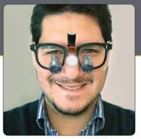
LED DayLite® WireLess Mini HDi and NEW 3.0x Loupes