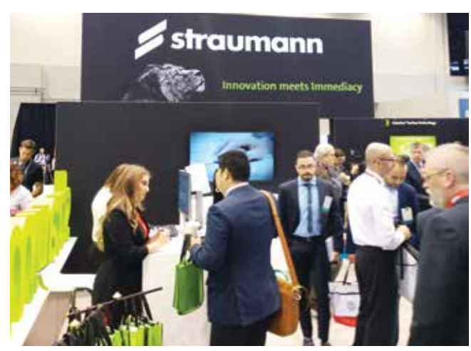
Attendees pack the Straumann booth, No. 301.