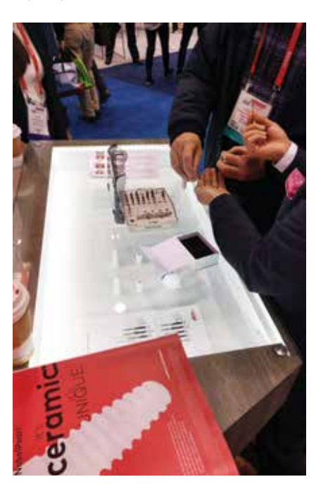
Stop by the Nobel Biocare booth, No. 501, to get a demonstration of the NobelPearl ceramic implant system.