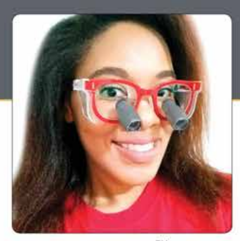
NEW Micro3.0EF Scopes<sup>TM</sup>