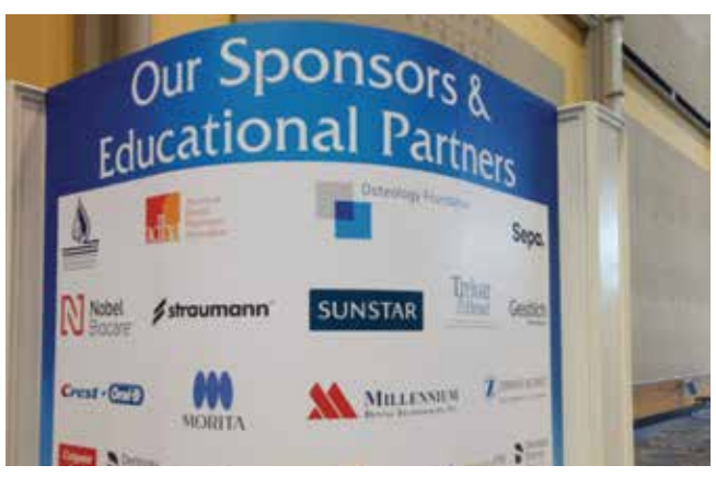
^ The AAP annual meeting wouldn't be what it is without the sponsors and educational partners.