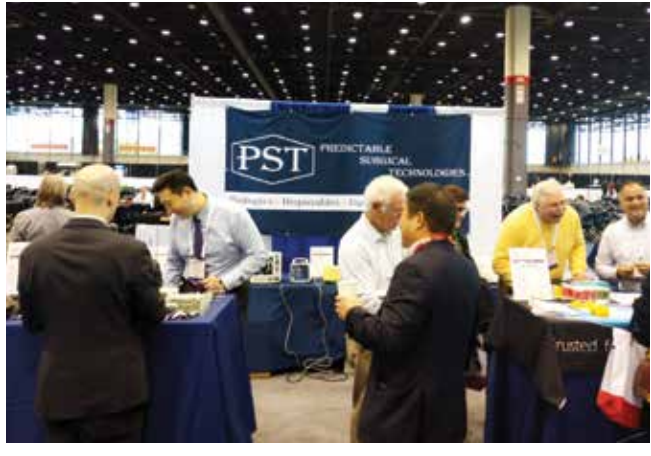
Stop by the Predictable Surgical Technologies booth, No. 751, to find show specials on a number of products, from disposables to equipment to instruments.