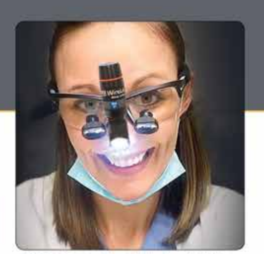
NEW LED DayLite® WireLess IR HDi