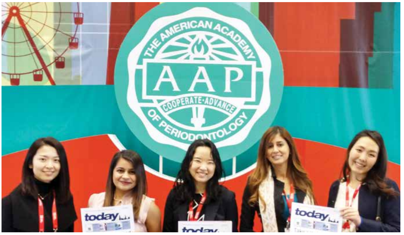
Attendees to the American Academy of Periodontology 105th annual meeting are all smiles Sunday afternoon.