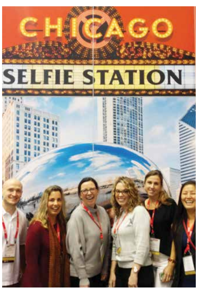
· Don't forget to take a selfie, like these attendees, to remember your time here at the AAP annual meeting.