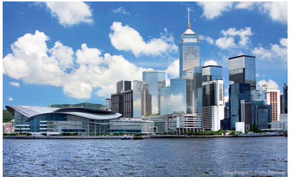
Hong Kong

pacts of socio-economic dynamics; and fostering fundamental research and translational technology. It is a blueprint for adapting and changing the dental profession to a world in constant evolution.