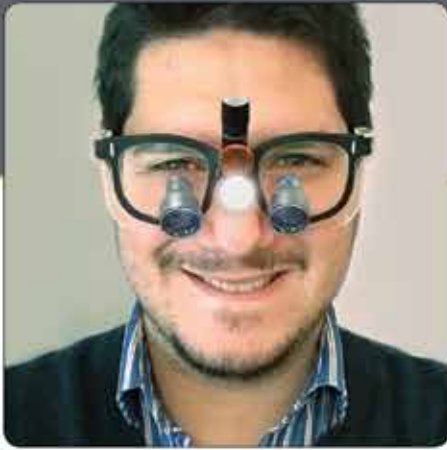
LED DayLite® WireLess Mini HDi and NEW 3.0x Loupes