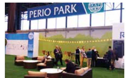
The Perio Park, found at booth No. 150, is a great place to relax, charge your electronic devices or purchase food and beverages.