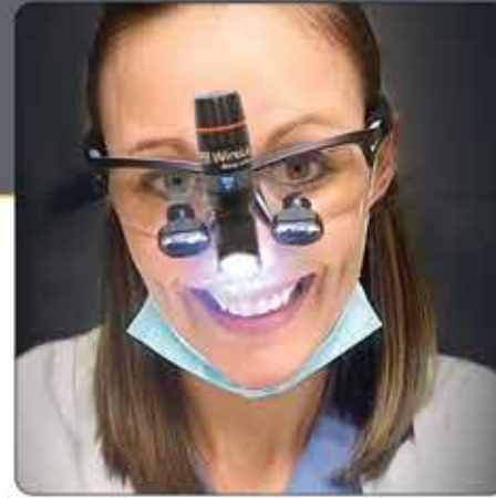
NEW LED DayLite® WireLess IR HDi