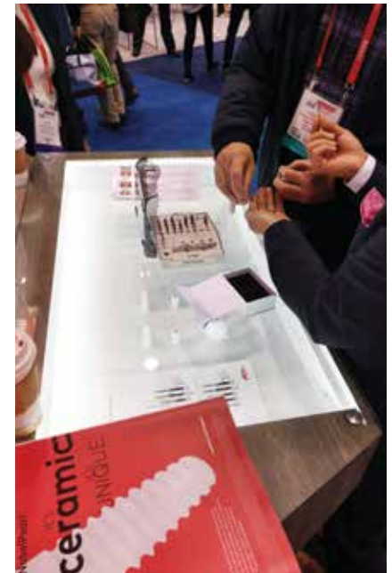
• Stop by the Nobel Biocare booth, No. 501, to get a demonstration of the NobelPearl ceramic implant system.