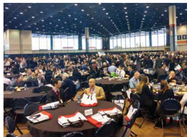
• Attendees break for lunch on Sunday afternoon during the AAP annual meeting.