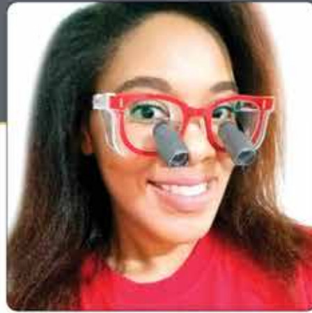
NEW Micro3.0EF Scopes™