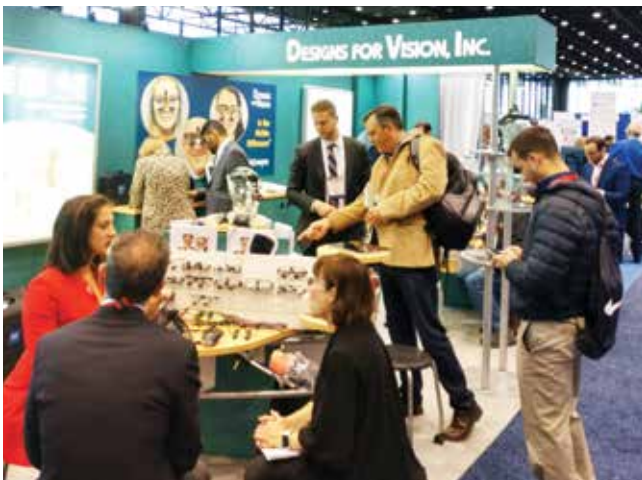
• Stop by Designs For Vision, booth No. 426, for all your loupe and lighting needs.