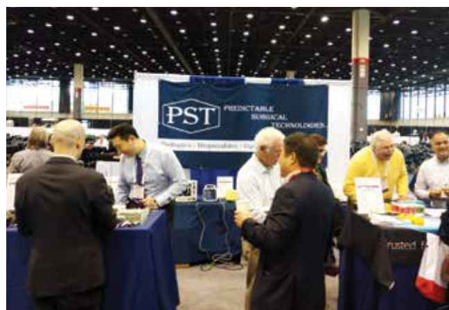
• Stop by the Predictable Surgical Technologies booth, No. 751, to find show specials on a number of products, from disposables to equipment to instruments.