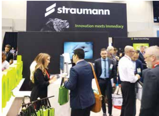
Attendees pack the Straumann booth, No. 301.