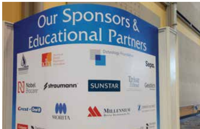
The AAP annual meeting wouldn't be what it is without the sponsors and educational partners.