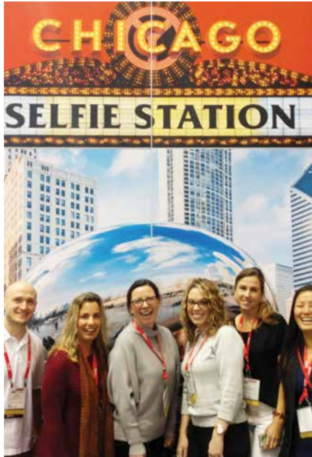
Don't forget to take a selfie, like these attendees, to remember your time here at the AAP annual meeting.