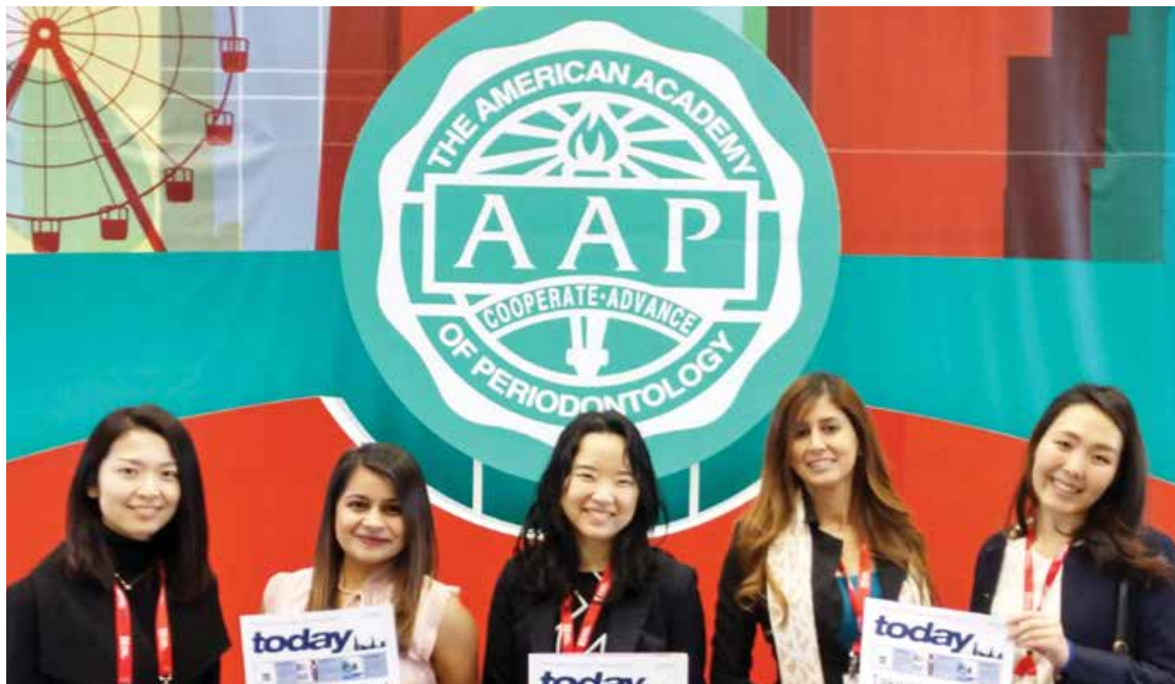
Attendees to the American Academy of Periodontology 105th annual meeting are all smiles Sunday afternoon.