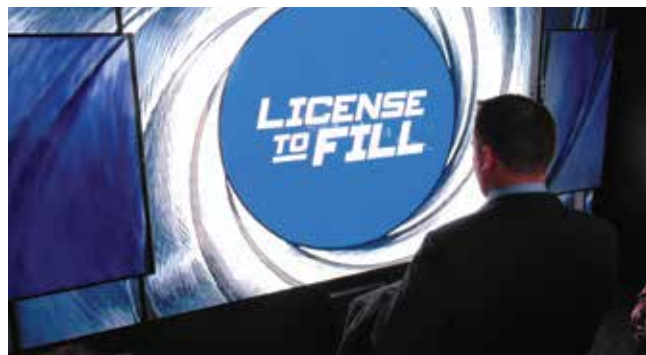
• You can see a James Bond-themed movie presentation in the Henry Schein One booth (No. 2825).