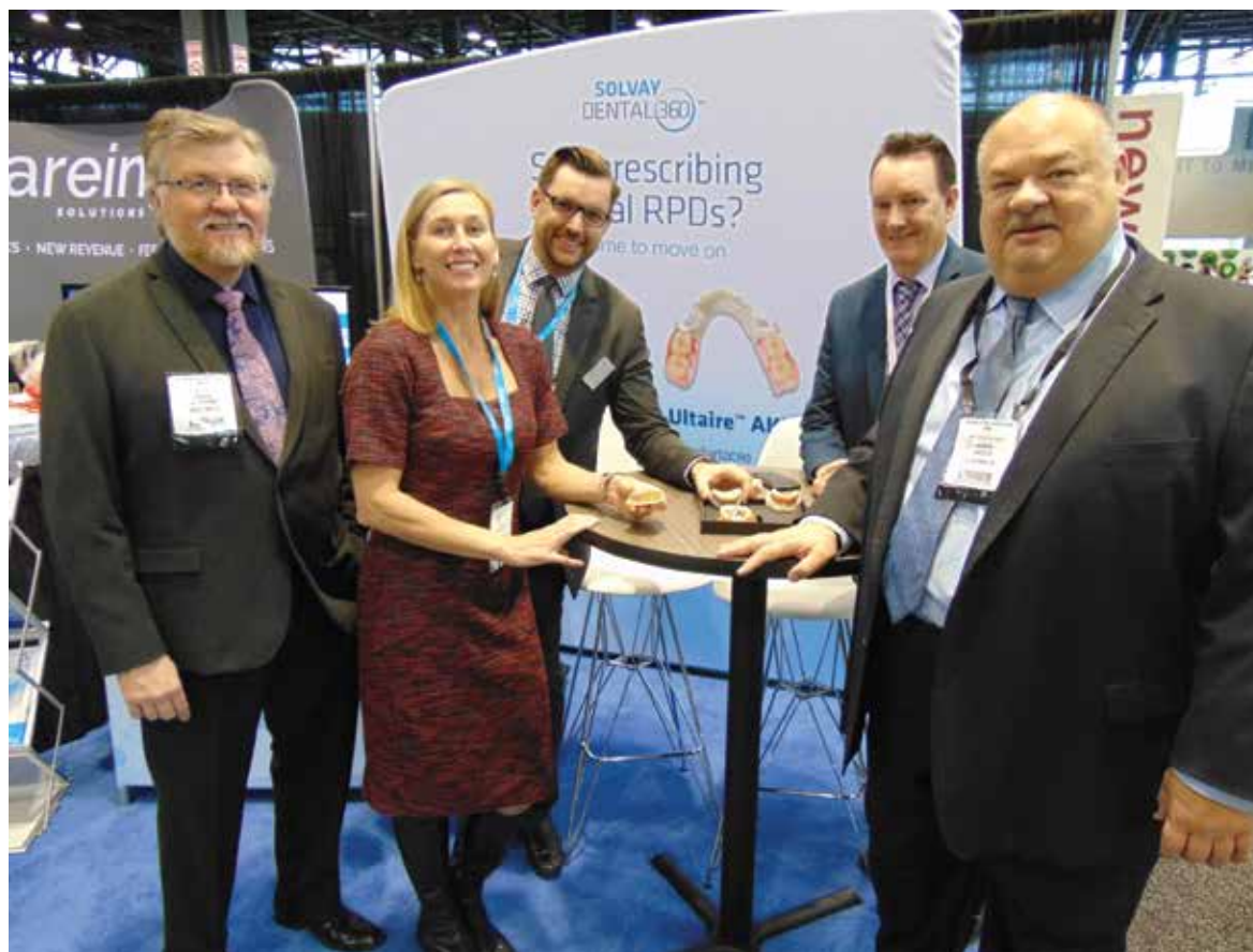
• The folks at Solvay Dental 360 (booth No. 1545) are here at the Midwinter Meeting to tell dental professionals about Ultaire AKP, a high-performance polymer for RPD frames.