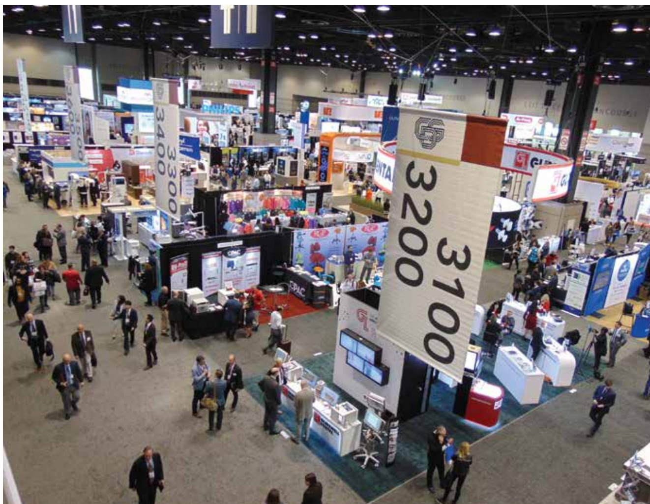
• As seen from above on Friday morning, the show floor bustles with activity.