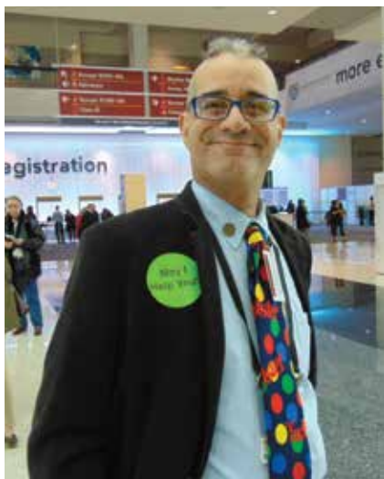
• Here at the Midwinter Meeting, Mercury is available to help attendees with information.