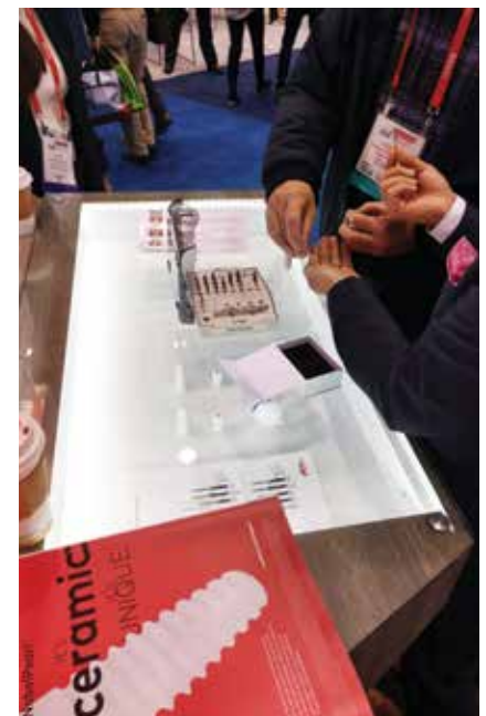
• Stop by the Nobel Biocare booth, No. 501, to get a demonstration of the NobelPearl ceramic implant system.