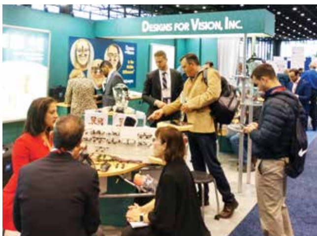
• Stop by Designs For Vision, booth No. 426, for all your loupe and lighting needs.