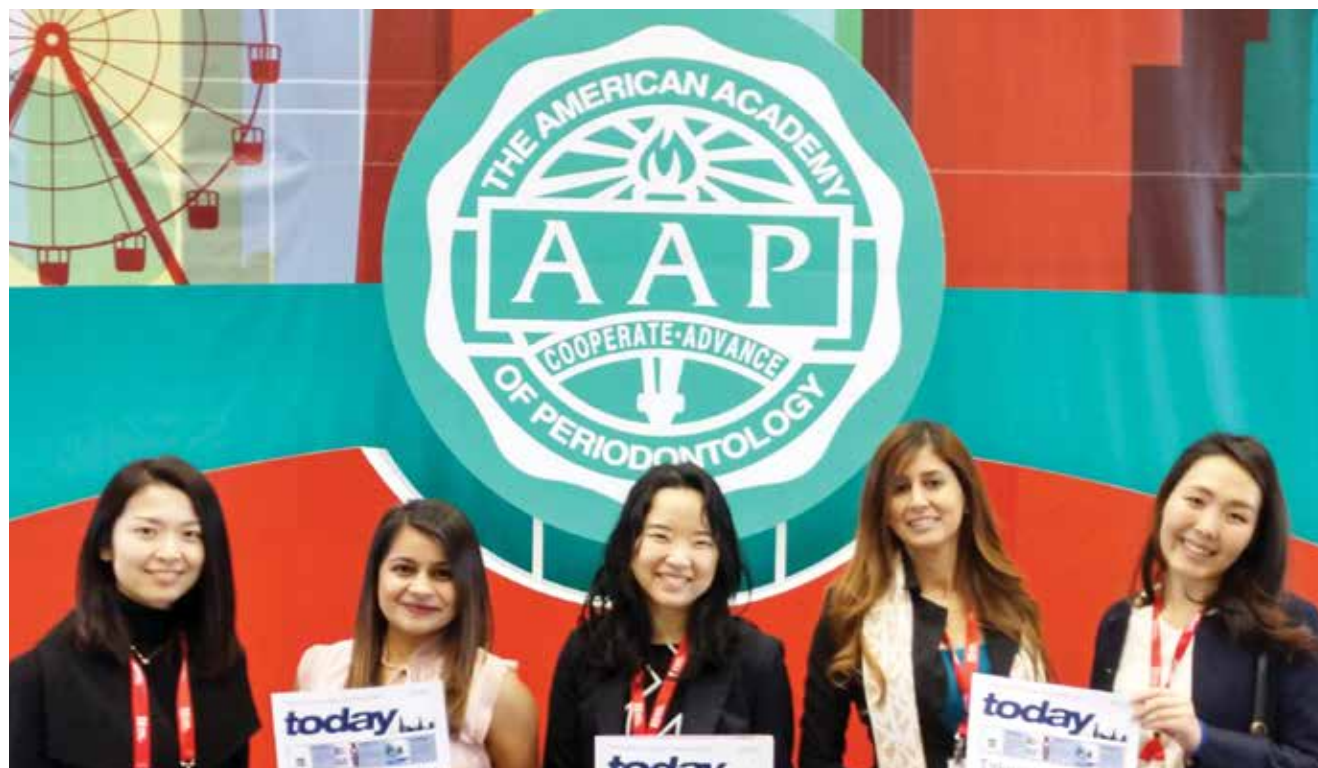
Attendees to the American Academy of Periodontology 105th annual meeting are all smiles Sunday afternoon.