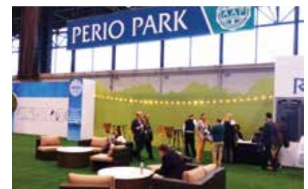
The Perio Park, found at booth No. 150, is a great place to relax, charge your electronic devices or purchase food and beverages.