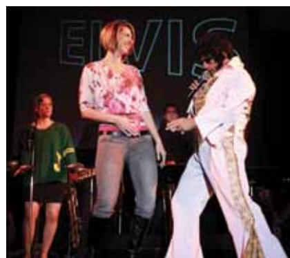
It's 'Viva Vancouver' tonight, with a little less conversation and a lot more hilarity, courtesy of The Timebenders Experience.

Catch up with friends and colleagues while enjoying a light snack, beverage and lots of dancing and laughing.