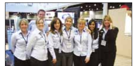
• The gang's all here at the Oral Sciences booth (No. 1029).