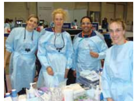
• These dental professionals are on hand here at Yankee to provide free care to children as part of the TeamSmile volunteer program.