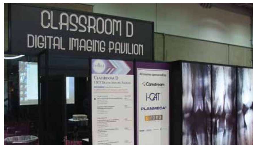
The Digital Imaging Pavilion, located on the exhibit hall floor in Classroom D, is one of many spots for learning here at the Yankee Dental Congress.