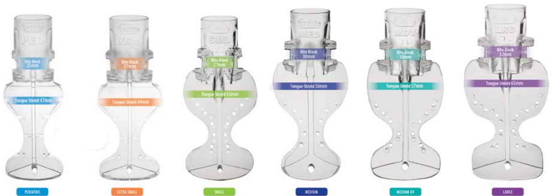
• The Isolite mouthpieces are now available in six patient-friendly sizes.