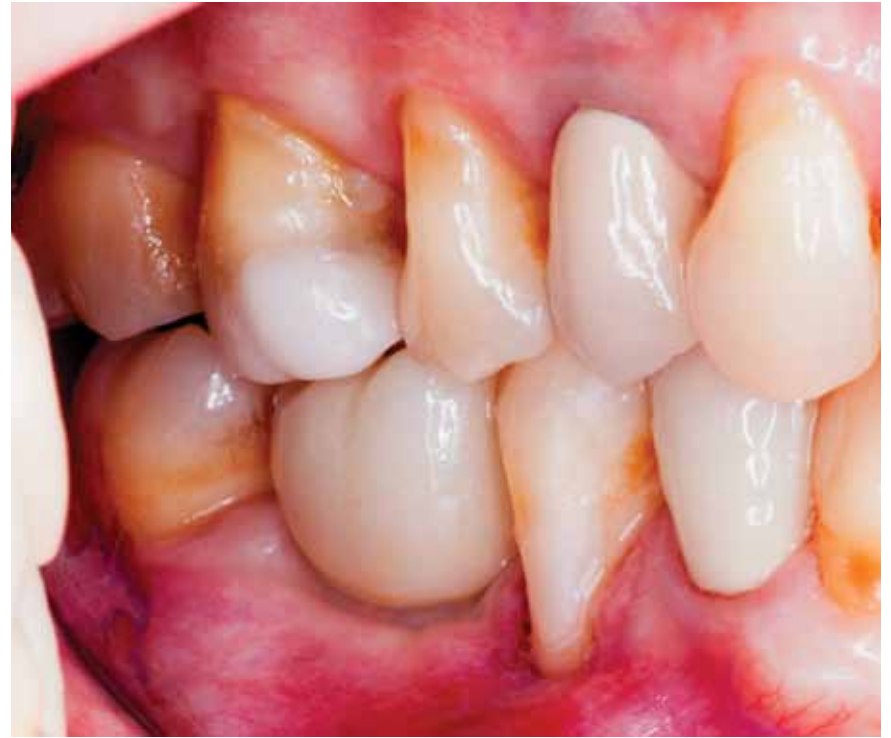
• Fig. 2: The patient was extremely pleased with the final restoration, the CAD/CAM design of which established ideal gingival margins.