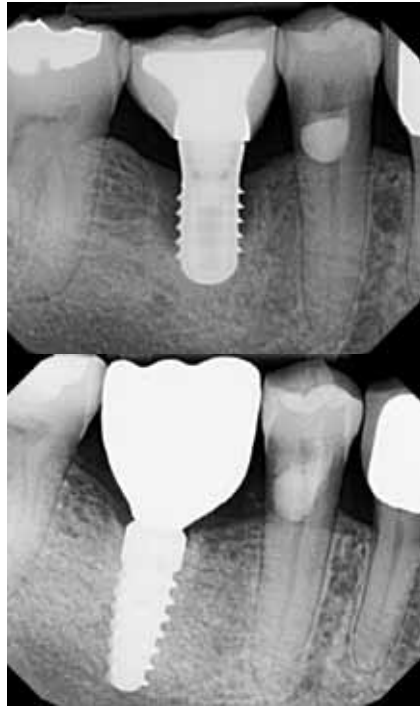
• Figs. 1a, b: Side-by-side comparison of preoperative radiograph of compromised implant (top) and final radiograph with new Hahn Tapered Implant (bottom) illustrates complete osseointegration as well as regeneration of the crestal bone.

A 55-year-old male presented for treatment with a missing second molar. After thorough intraoral and extraoral evaluation, guided implant surgery was proposed to and accepted