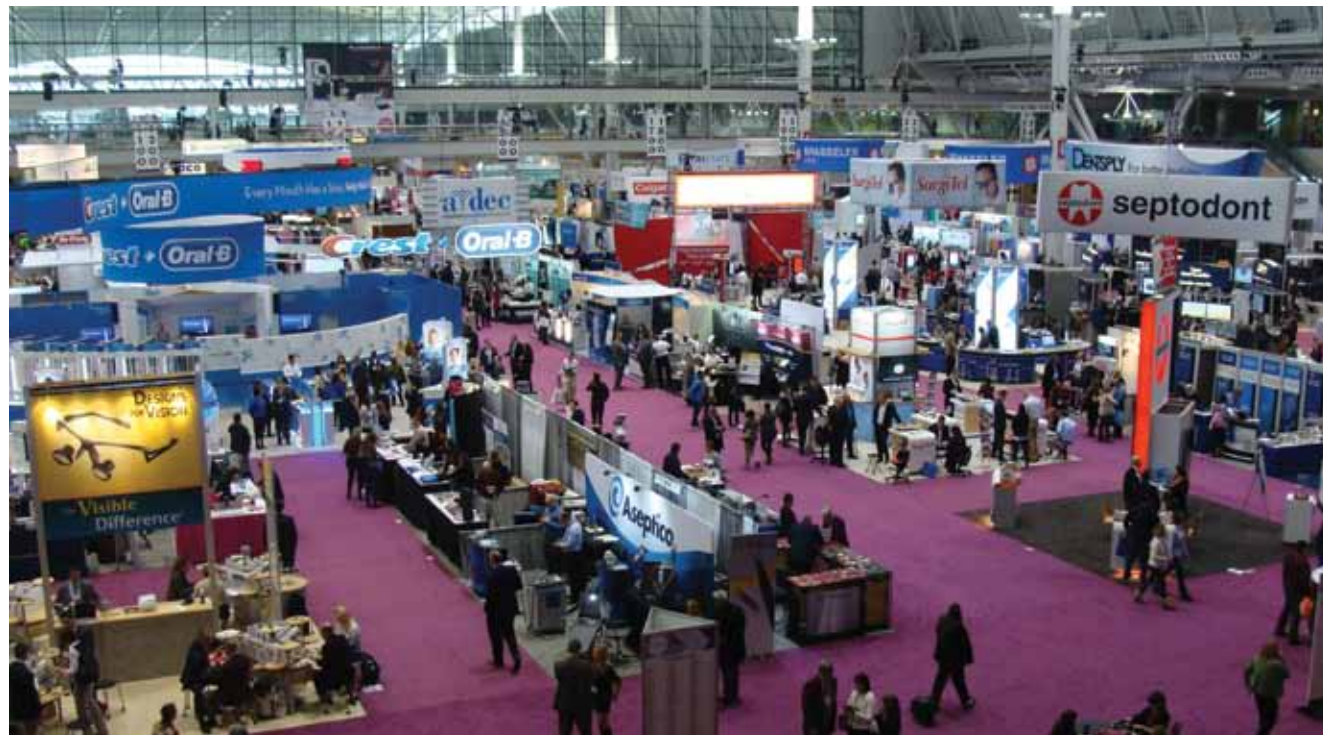
Find everything you need in the exhibit hall at the 2016 Yankee Dental Congress.