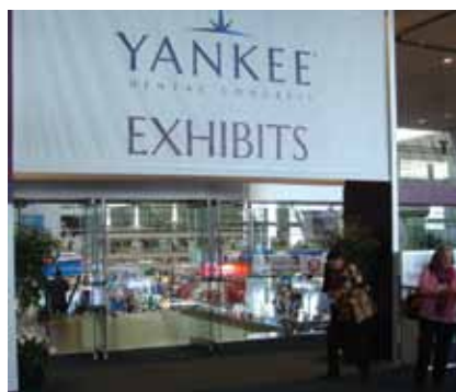
• It's this way to the exhibit hall, where more than 450 companies are showcasing supplies and equipment.

long-standing reputation for providing quality dental materials, recently launched Ca-Lok Flowable Adhesive Calcium Base/Liner, and you can learn more about this new product at the company's booth, No. 2113.