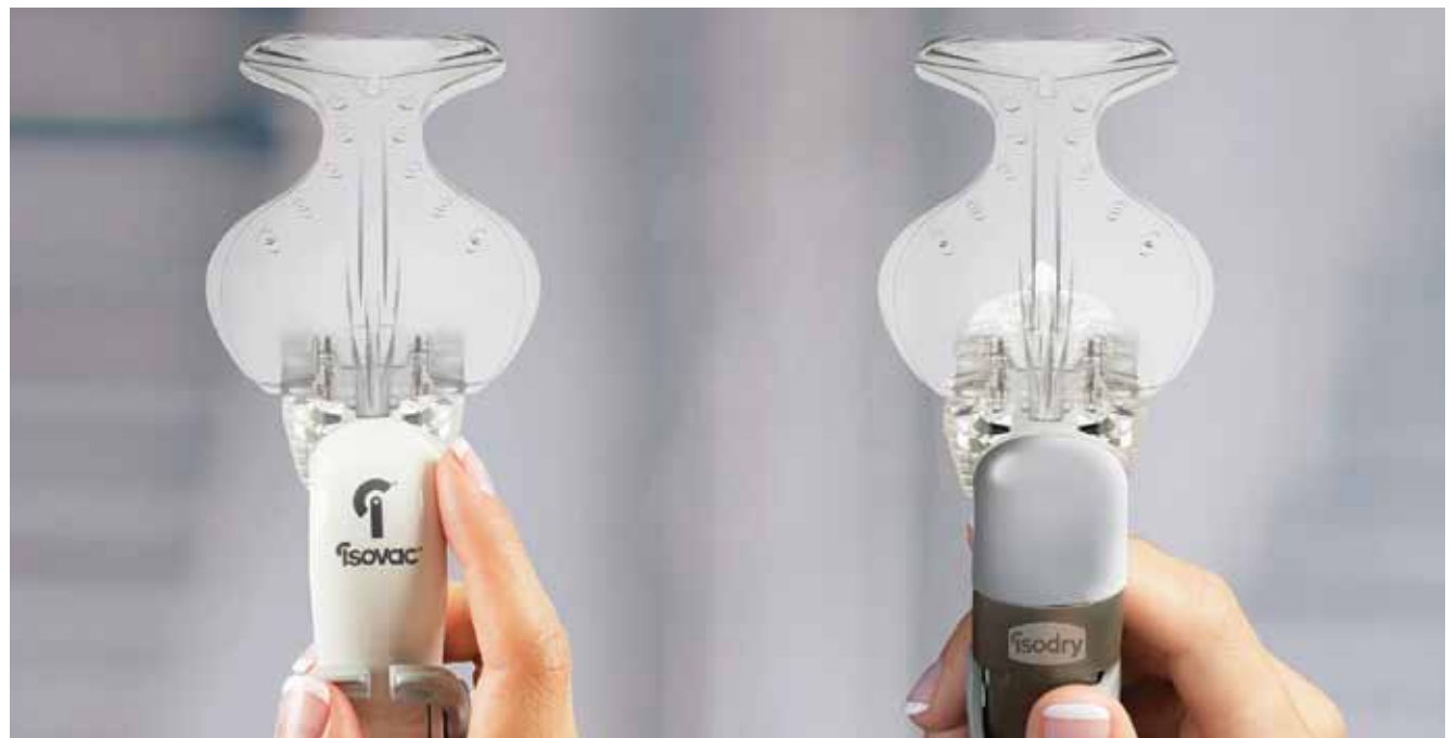
• The Isovac and the Isodry.

The key to the technology is the "Isolation Mouthpiece." Compatible with Isolite's full line of products, the mouthpiece is the heart of the system. It is specifically designed and engineered around the anatomy and morphology of the mouth to accommodate every patient, from children to the elderly.