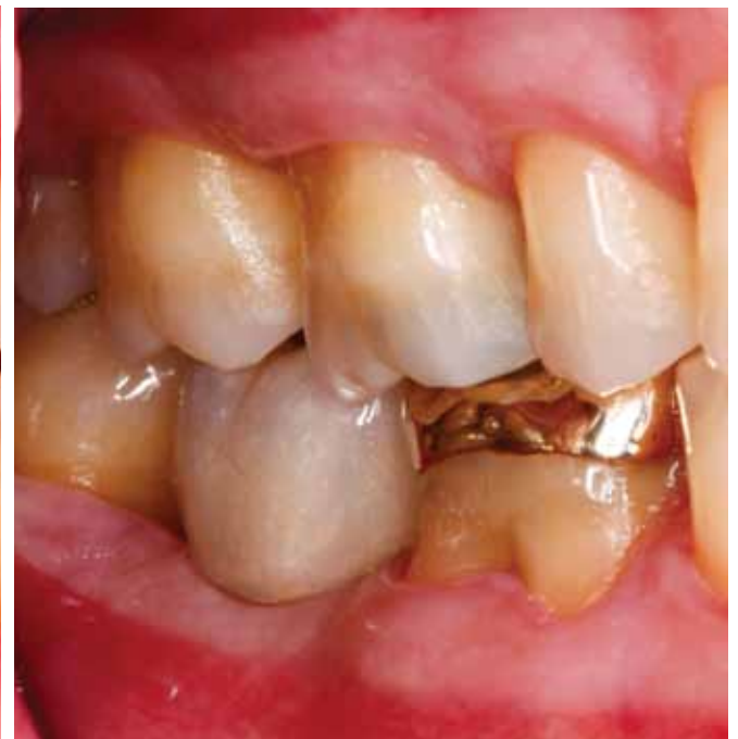
• Figs. 3a, b: The patient's edentulous space in the area of tooth #30 (left) was restored with precision via guided surgery, which established the exact implant position needed for an esthetic final restoration (right).

by the patient, who wanted treatment to be as efficient and painless as possible. Because bone grafting was unnecessary and there was adequate keratinized tissue present, a flap would not need to be reflected, making the flapless approach facilitated by guided surgery ideal. Further, the added expense was not an obstacle for the patient.