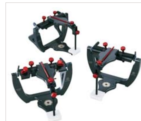
I Fig. 3

Novovol (Booth E02/04) from Canada is showcasing its local dental anaesthesia Posicaine that, according to the company, can be used in both simple and complex dental procedures.