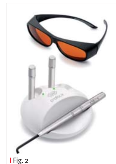
I Fig. 2

W&H's new Proface light probe ( Fig. 2 , Booth G22/26) is supposed to enable direct visual detection of caries in opened cavities and, therefore, minimise the risk of caries recurrence. According to the company, the device enables selective treatment during caries excavation based on Fluorescence Aided Caries Excavation (FACE), a method in which violet light is applied to the opened cavity where metabolic by-products, left by the bacteria in infected dentine and not visible to the human eye, fluoresce red while healthy tooth substance fluoresce green.