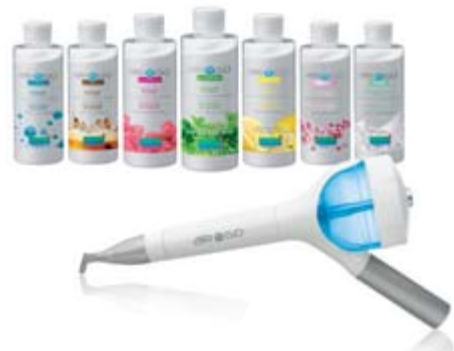
I Fig. 1

High quality dental materials will be on display at Promedica's booth (K25). Besides its proven lightcuring micro hybrid composite Composan LCM, the German manufacturer will be also showcasing its Composan bio-esthetic composite material that offers extremely low polymerisation shrinkage and more resistance to strong abrasion.