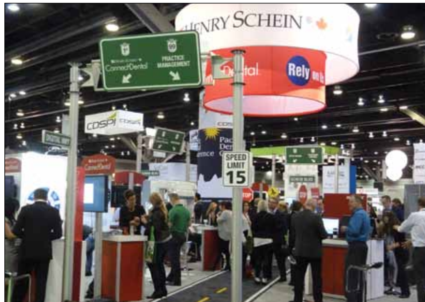
• Take a hard right as you enter the Exhibit Hall to merge into the always-busy Henry Schein booth, No. 709.

In the Orascoptic/KaVo Kerr booth, No. 1108, you can test out the Spark, a cordless headlight that dispenses its weight evenly across the frame to minimize concentrated facial pressure. Be sure to try the EyeZoom, too, which the company says is the first and only loupe