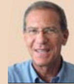
Prof. Urs Belser Switzerland

General dentistry has undergone major changes during the last 20 years, not just in the way clinicians treat their patients, but particularly in the way patients request treatment and their increased expectations of outcomes. In particular, the practice of restoring patients' compromised teeth has become less complex in some ways, yet more challenging in others. Tooth replacement is increasingly being performed through the use of restorations supported by dental implants, and numerous elegant and predictable clinical approaches to this have been developed.