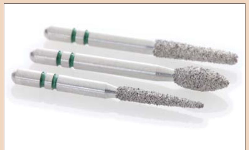
Abrasive Instruments