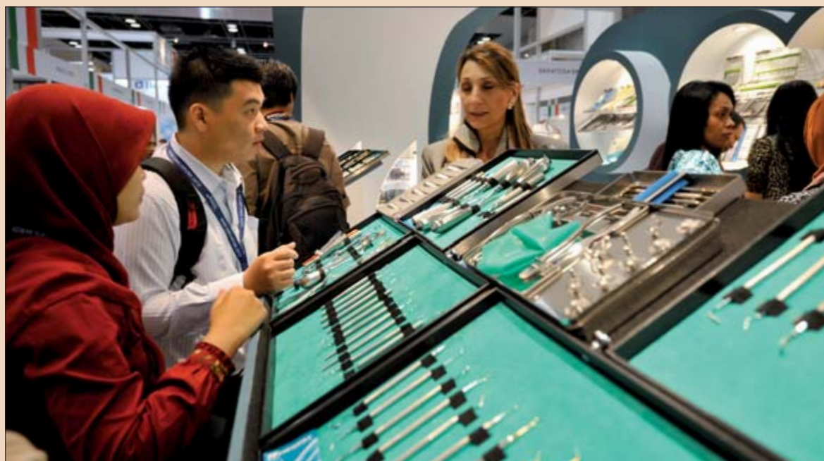
The restructured regulations will benefit dental manufacturers.

The organisation said that it will look into revising fees for