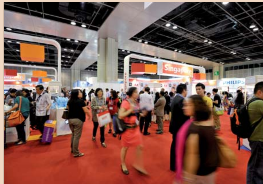
More visitors than ever were swarming the aisles of the Suntec exhibition hall on Saturday.

he said that Koelnmesse has been working closely with professional dental associations in countries like Thailand and Vietnam, who also brought more attendees to IDEM Singapore.