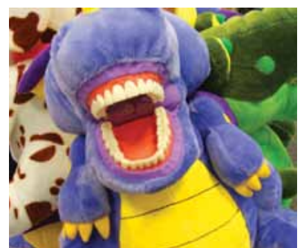
• Young patients will love the treats you pick up at Sherman Specialty's booth, No. 3826.