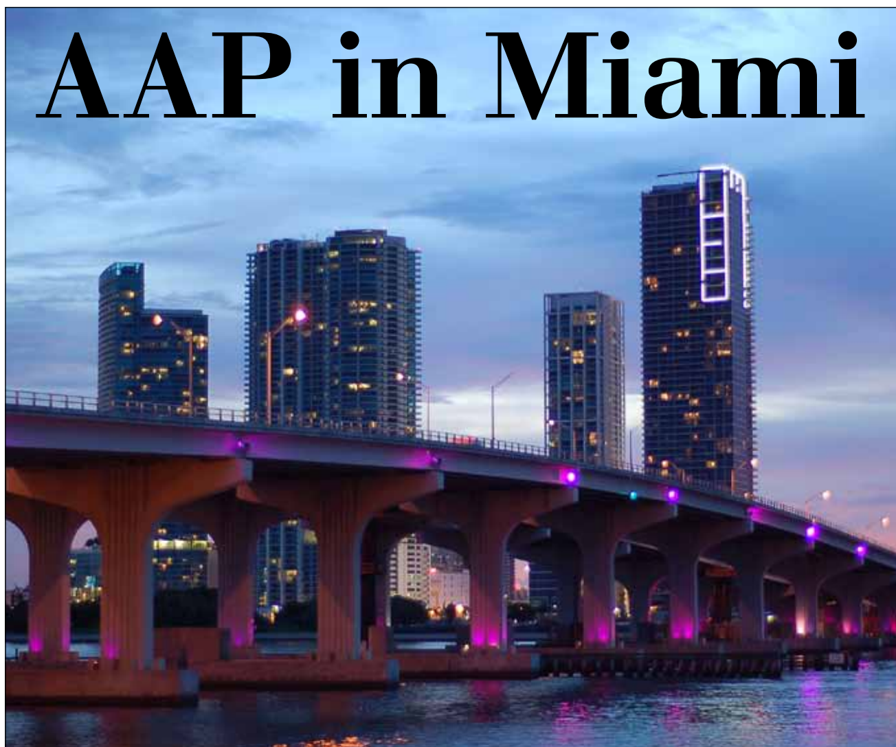
The 97th annual meeting of the American Academy of Periodontology will take place Nov. 12-15 in Miami Beach, Fla.