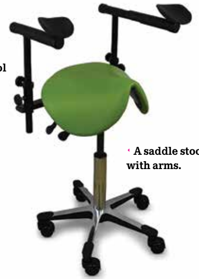
• A saddle stool with arms.