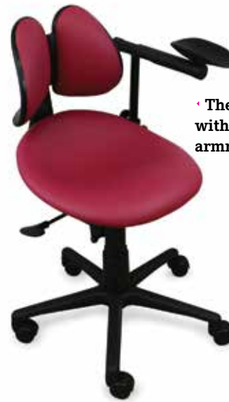
• The 400-D stool with a relaxed armrest.

For more than 20 years, customers have been feeling and seeing the benefits of these telescoping arm supports, and many of our customers attribute the prolonging of their careers to our unique arm support system. All of RGP's stools can easily accept the arm supports. Combining our arm support system with our line of stools and chairs makes for an enjoyable