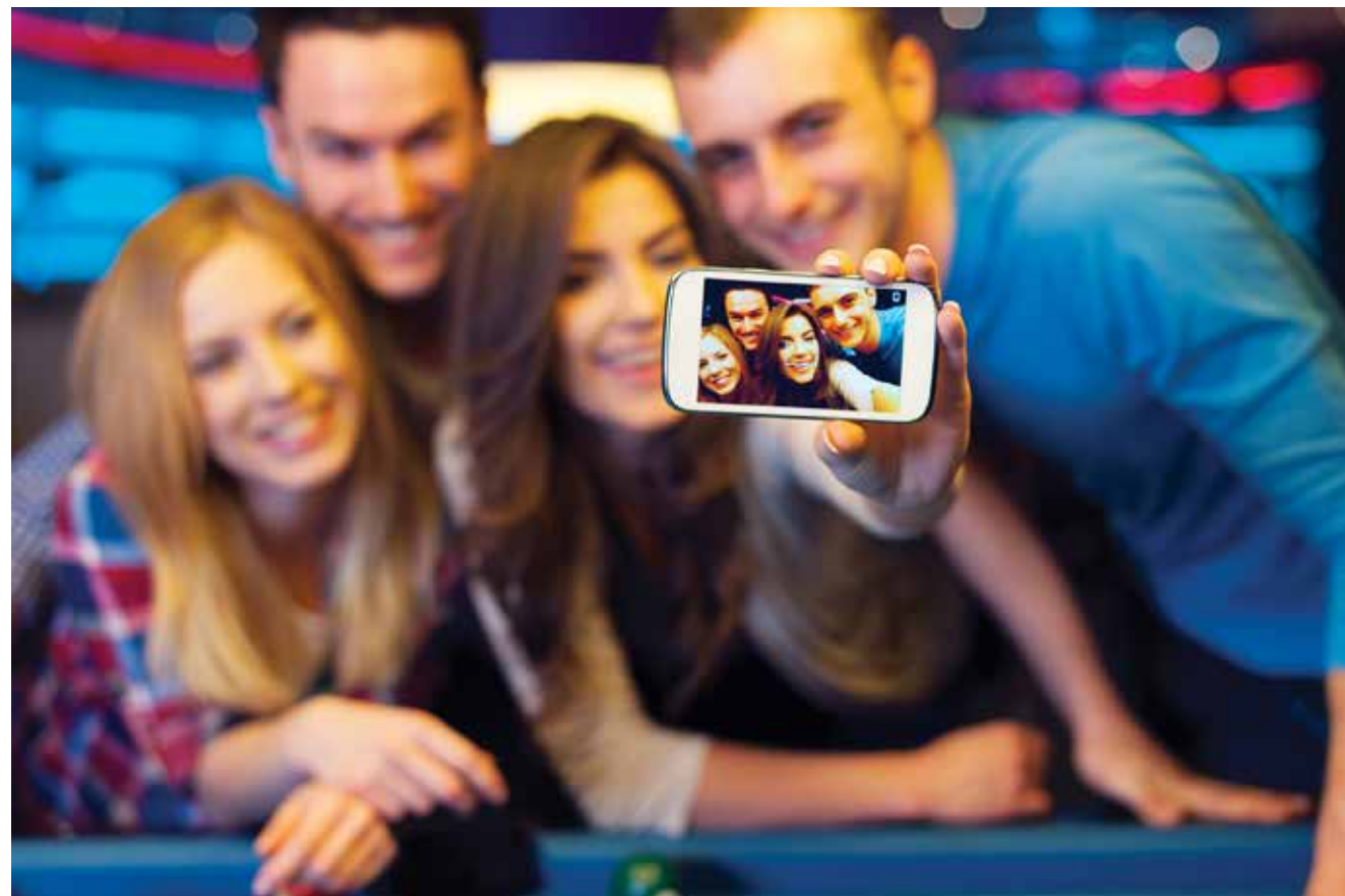
• Share your Hinman thoughts and experiences on social media using the #MyHinman hashtag, and you can help raise money for student scholarships.

In addition, the New Product Showcase will be open from 9 a.m. to noon Friday. Designed for the entire dental team and open to all attendees at no fee, 18 companies will present the latest products and services in an informative, non-commercial manner.