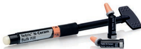
Tetric® N-Ceram Bulk Fill sculptable

* Compared with Tetric® N-Flow and Tetric® N-Ceram Data available on request.