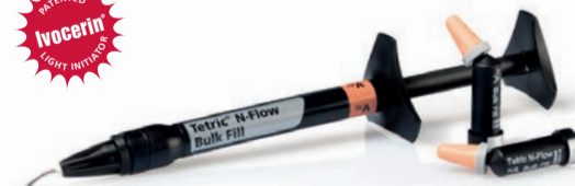
Tetric® N-Flow Bulk Fill flowable