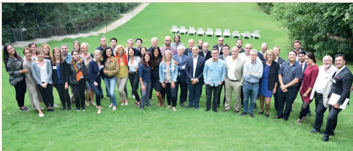
More than 30 publishers from around the globe joined this year's Annual Publishers' Meeting in Berlin.

In collaboration with its German licensee OEMUS MEDIA, DTI will ▶ Page 4