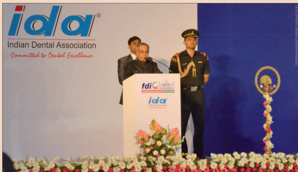
Pranab Mukherjee addressing delegates of the FDI Annual World Dental Congress in Greater Noida, New Delhi.

Seventy-eight-year-old Mukherjee, who attended the opening ceremony at the India Expo Centre and Mart as guest of honour, said that his government is well aware of the poor standards of oral health in the country. Several programmes and projects conducted by his government and organisations like the Indian Dental Association are underway to raise awareness of the importance of good oral health and hygiene among different segments of the Indian population, with the FDI congress being one of them.