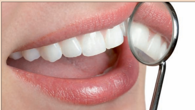
Less people in the US will have missing teeth by 2050.