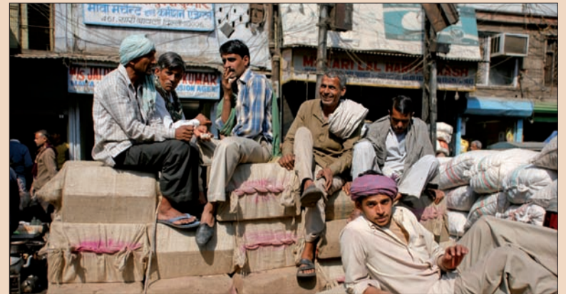
Workers enjoying a cigarette. The consumption of tobacco in India is on an all-time high.

Thank you very much for the interview. ☐