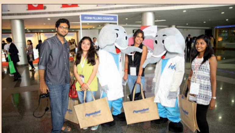
Picture showing visitors of the FDI Annual World Dental Congress in India posing with Dr Strong Teeth, a new mascot developed by the Indian Dental Association to promote good oral health.

According to Daruwalla, Dental Tribune South Asia will be available in print and online.