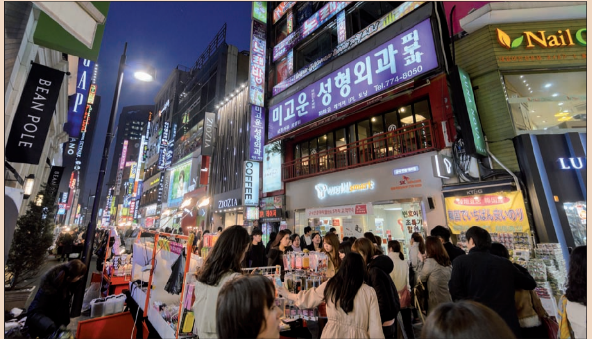
Crowded street in Seoul, the capital of South Korea. The country has now the highest rate of dental implants per capita in the world.

Dental implants have come a long way in South Korea since they were introduced to the country four decades ago. Back then, US and European products wholly dominated the still young market. Now, with 225 implants per 10,000 people, the country has one of the highest implants per capita rates in