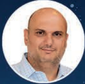
Antonis Chaniotis Greece