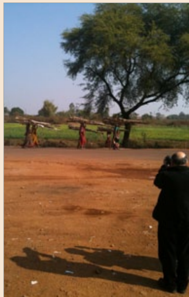
Women at work

That great American philosopher and boxer Mohammed Ali said "Service to others is the rent you pay for your room here on earth".