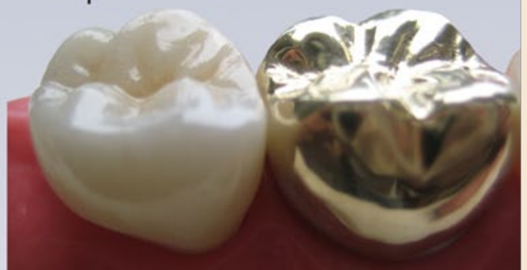
Crowns by A Whittome of Lifelike Dental Ceramics

Opalite by core 3d centres is a new metal free product offered by Lifelike Dental Ceramics