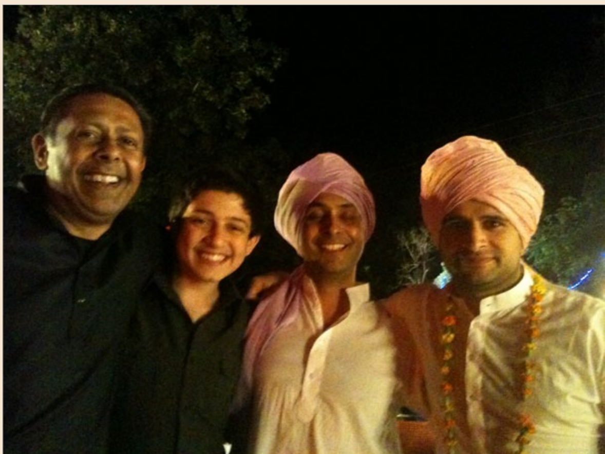
The Four Amigos

CAD/CAM SYSTEMS | INSTRUMENTS | HYGIENE SYSTEMS | TREATMENT CENTRES | IMAGING SYSTEMS