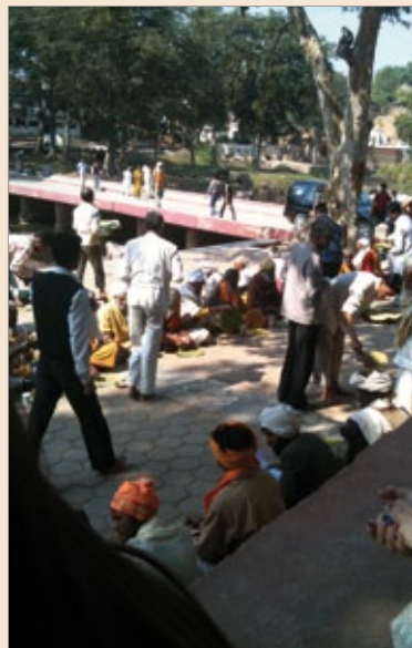
Feeding the Holy men