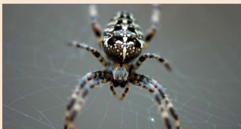
Visiting the dentist is seen as more scary than spiders

"The issue of anxiety affects everyone in the profession. Collectively we need to work together and we hope that the whole profession will get behind this year's National Smile Month campaign which starts on the 15 May 2011. The campaign offers the best opportunity for everyone to reach millions of people whose nerves and anxiety are directly affecting their oral health." DT