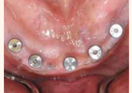
Figs. 1a, b: The patient presented with six maxillary and five mandibular implants that were fully integrated and ready for restoration.