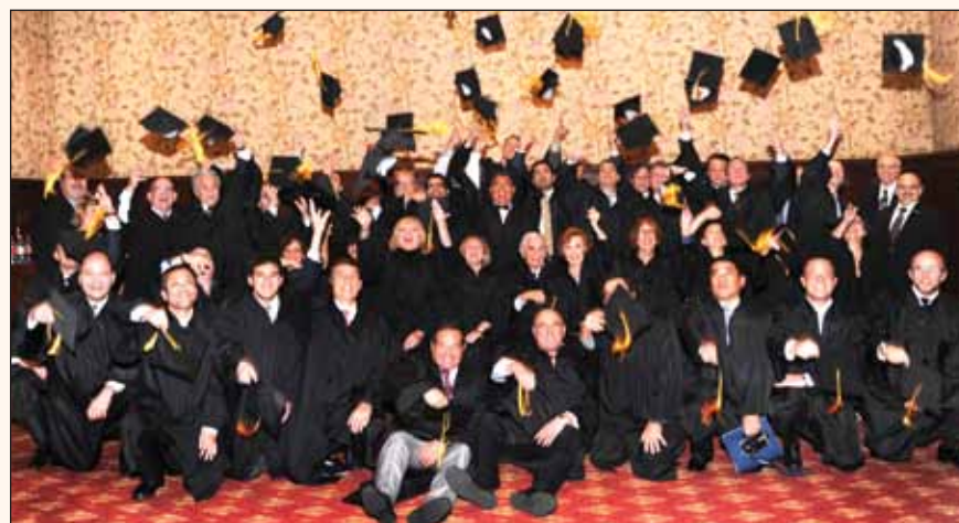
Like this group earning IADFE fellowships in 2013, a new group will wear gowns and toss caps in December in New York City.