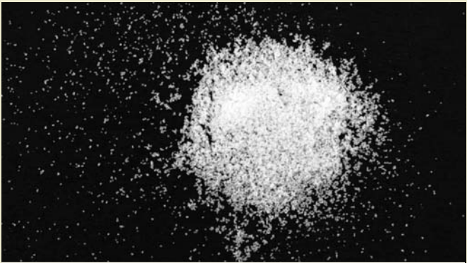
The findings of a recent study have suggested that the U.S. Sugar Association used dietitians to refute dentists' anti-sugar messages at professional meetings and in the media.

monitored professional and consumer attitudes toward sugar and made media appearances. They also interacted with dental professionals by documenting their attitudes toward sugar, influencing a professional conference to include pro-sugar speakers, developing a media program that minimized sugar's role in causing dental caries, and by monitoring and criticizing dental researchers who sought to examine the high-sugar content of breakfast cereals. According to the World Health Organization (WHO), dental caries is a major public health problem and is the most widespread noncommunicable disease. WHO states that it can be prevented by avoiding dietary free sugars.