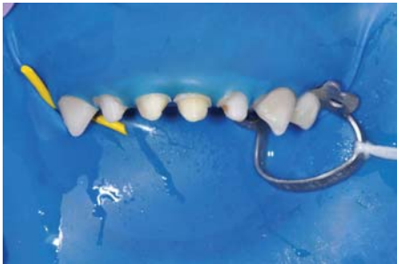
Fig. 4: Crown preparations with margins kept supra-gingival