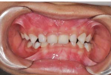
Fig. 10: Four month follow up showed good gingival health and no discoloration of the crowns.