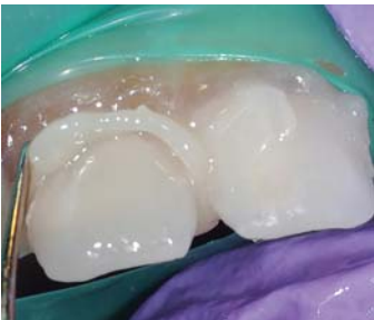
Fig. 8: Excess cement removed from margins prior to final cure.