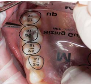
Fig. 3: Edelweiss Sizing Guide in small, medium and large size for crown size selection