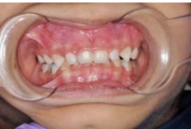
Fig. 9: Front teeth restored with edelweiss pediatric crowns