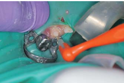
Fig. 7: Bonding agent applied and light cured for 20 seconds