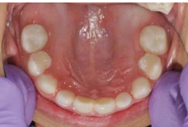
Fig. 11: Preoperative situation