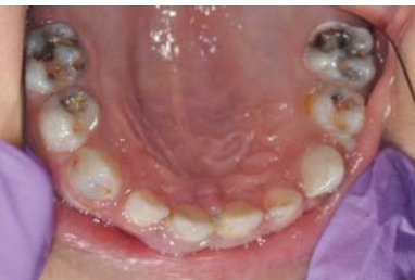
Fig. 12: Postoperative situation