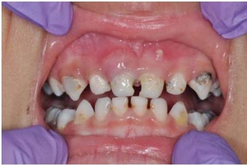
Fig. 1: Caries associated with the four front teeth