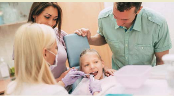
According to a recent systematic review, the socio-economic status of parents influences the prevalence of periodontal diseases in their children.

BRISBANE, AUSTRALIA - Numerous studies have been published on the association between dental caries and various family contextual factors. However, similar research with regard to periodontal disease is limited. Thus, the aim of a recent systematic review was to assess the influence of family characteristics on periodontal diseases in children.