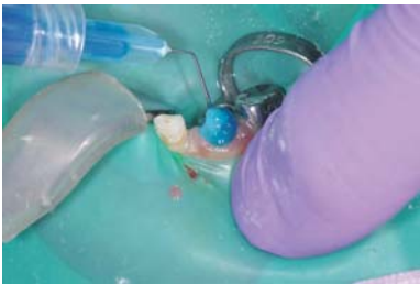
Fig. 6: Tooth surfaces prepared with 37% phosphoric acid for 10 seconds.