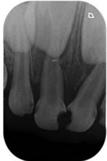
Fig. 2: Radiographic examination revealed pulpal involvement of caries in 51 and 61.