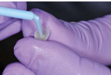
Fig. 5: Edelweiss Veneer Bond applied to inner surface of the pediatric crown, air dried and light cured