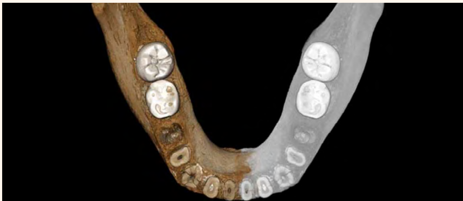
Virtual reconstruction of the Xiahe mandible, after digital removal of the adhering carbonate crust. The mandible is so well preserved that it allows for a virtual reconstruction of the two sides of the mandible.