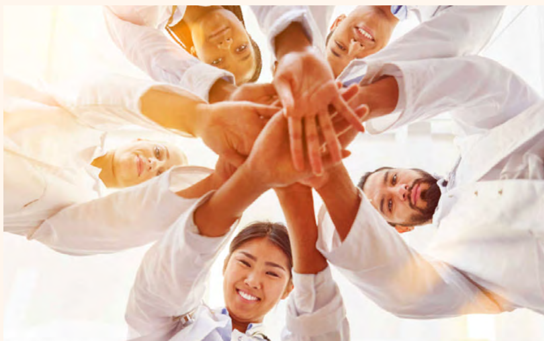
The Australian Dental Association has expressed its commitment to its continued work with the newly re-elected coalition to achieve affordable dental healthcare.

The ADA has long lobbied successive federal governments to address the urgent and growing need for additional, targeted and sustainable funding to meet the requirements of disadvantaged Australians, and it will continue its push for affordable oral healthcare with the re-elected coalition government.