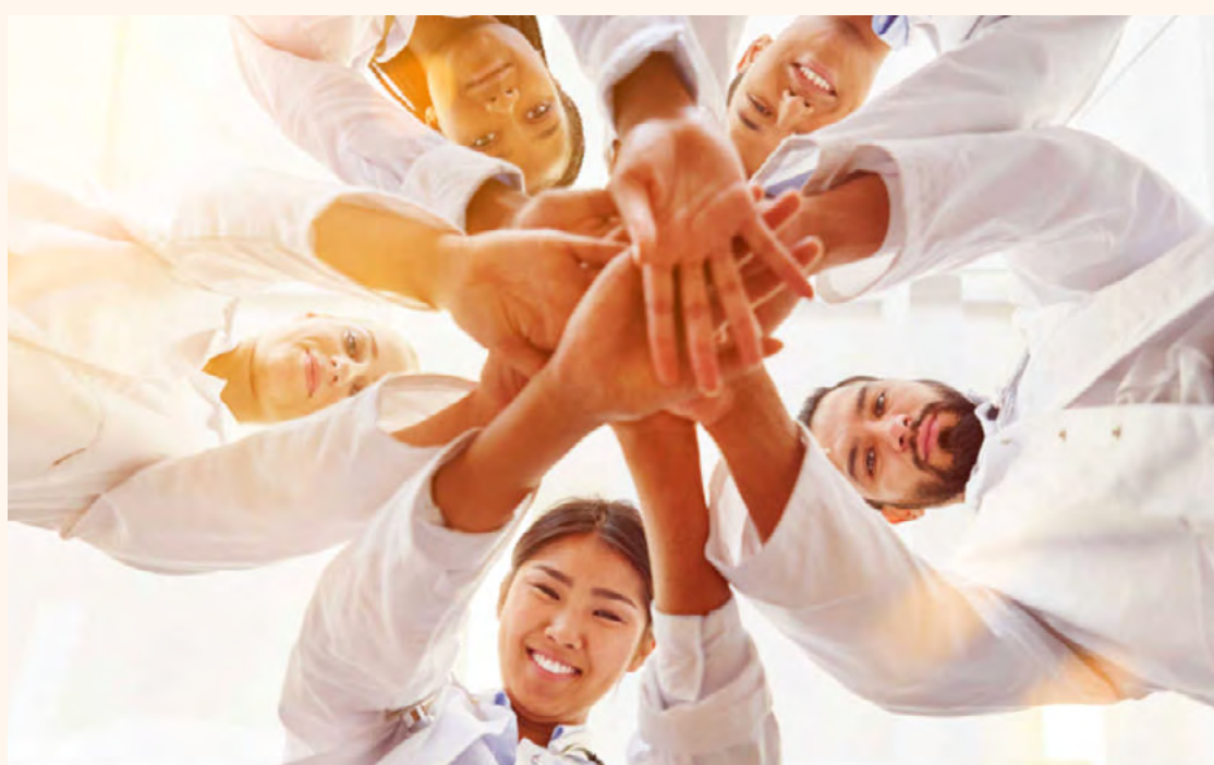
The Australian Dental Association has expressed its commitment to its continued work with the newly re-elected coalition to achieve affordable dental healthcare.

The ADA has long lobbied successive federal governments to address the urgent and growing need for additional, targeted and sustainable funding to meet the requirements of disadvantaged Australians, and it will continue its push for affordable oral healthcare with the re-elected coalition government.