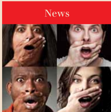
Move over Movember This month is Mouth Cancer Action Month