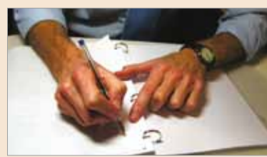
The GDC has published a discussion document regarding CPD

The GDC's current CPD requirements can be found on the website www.gdc-uk.org DT