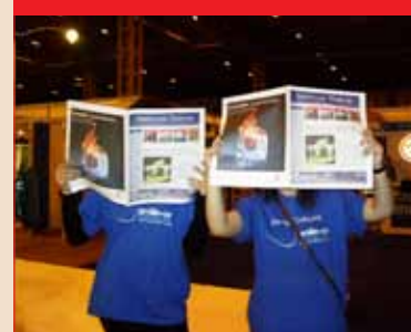
Showcase Preview A look at this year's BDTA dental showcase