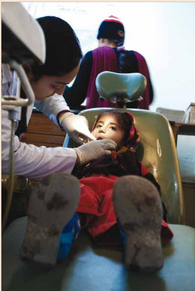
All treatments supplied to patients is free

Dental Tribune interviews the founders of the Pain Relief Clinic in Hansali