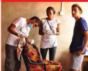
Outreach programme Dental students travel to Ghana