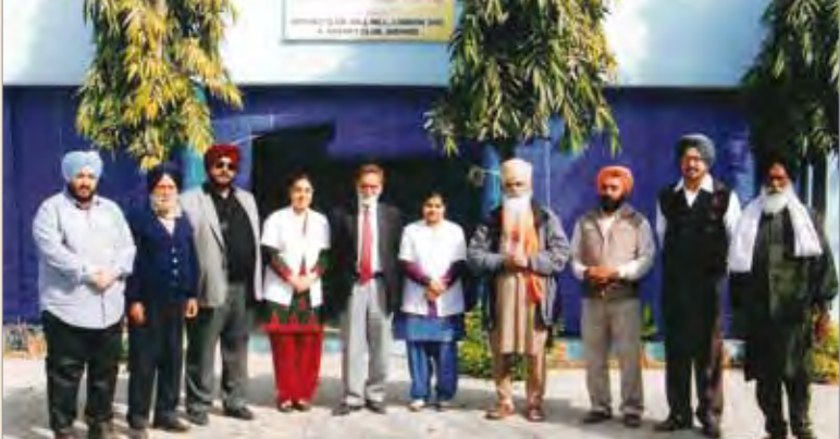
The team at the Pain Relief Clinic