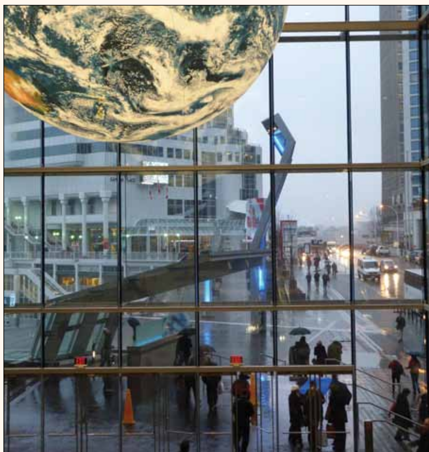
The entrance to the Vancouver Convention Centre on a rainy day during the 2012 Pacific Dental Conference. This year's conference, with a two-day exhibit hall, anticipates more than 300 companies with dental products and services in approximately 600 booths.